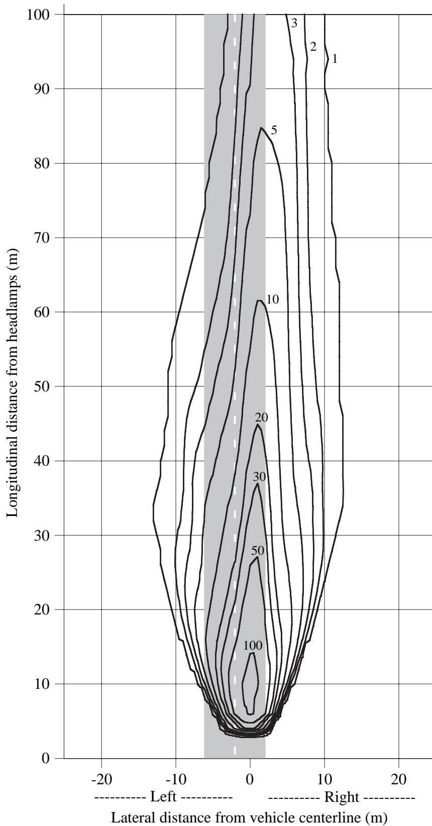
Figure 2. Isoilluminance diagram (in lux) on a vertical surface at the road surface from a pair of lamps with the median luminous intensities for the sales-weighted sample representing the low-beam headlamps on current passenger vehicles in the U.S. The shaded area represents a standard two-lane road. (Test voltage: 12.8 V. Lamp mounting height: 0.66 m. Lamp separation: 1.20 m. Lane width: 3.7 m.)