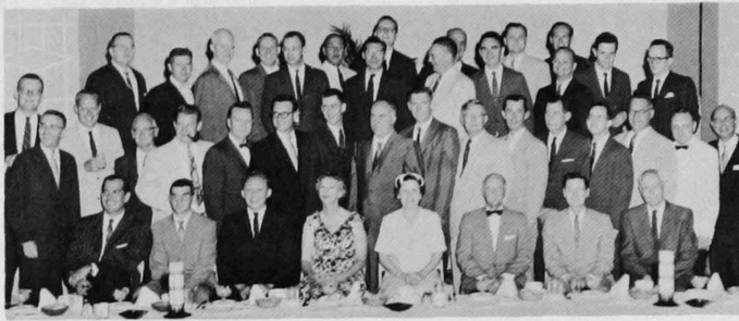
At the end of their two week Special Summer School for Lawyers, some of the "students" attended a "graduation dinner," as pictured above.