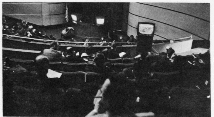
Overflow participants in the Advocacy Institute watch the sessions on closed-circuit television monitors.