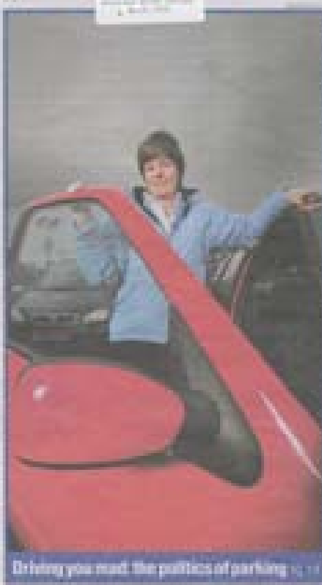
Driving you mad: the politics of parking 14

The problem of illiterate freshers is a serious one, and it is one that is being ignored by many universities. The fact is that a significant number of students who enter university are unable to read or write. This is a problem that is caused by a number of factors, including a lack of access to education in primary and secondary schools, and a lack of support for students who are struggling with their studies.