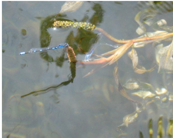
Figure 3. A box plot showing the mean reaction time of rock bass to each morph tested during the line and hook test.