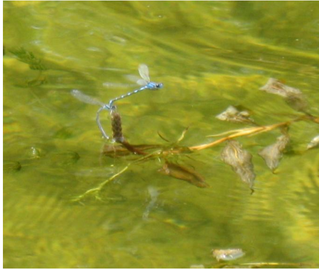
Figure 2. A female E. carunculatum beneath the water in North Fishtail Bay.