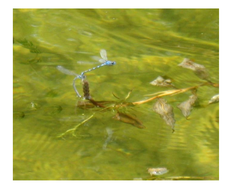
Figure 2. A female E. carunculatum beneath the water in North Fishtail Bay.