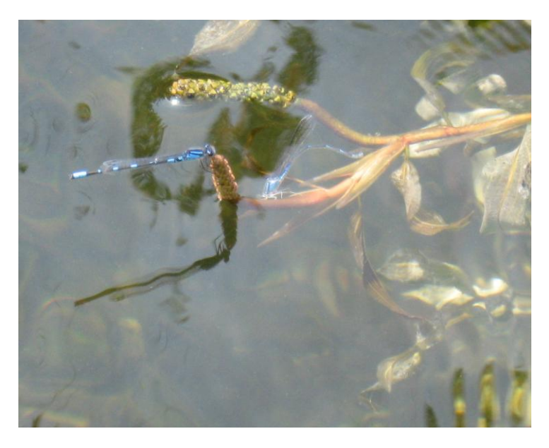
Figure 3. A box plot showing the mean reaction time of rock bass to each morph tested during the line and hook test.