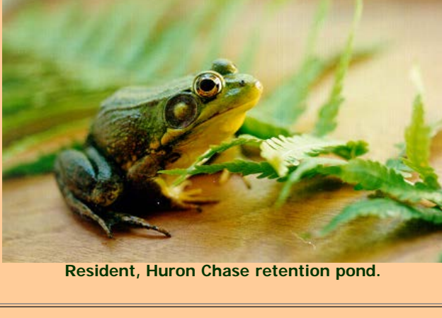
Resident, Huron Chase retention pond.