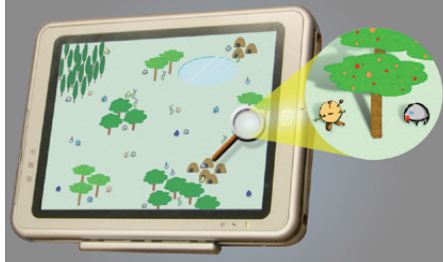
Figure 3: Imagined view of the proposed demo game, running on a Tablet PC. Expanded view shows the approximate level of detail that would be provided on Pocket PC devices.

The demonstration game we will develop will allow users to manipulate the behavior of animal entities (i.e. “sprites” in computer gaming parlance) in a simulated environment. These behaviors include feeding on other animals or on resources found in the environment and breeding with one another. The beauty of nonlinear, systems-based simulations (as opposed to the linear, scripted games one often sees sold commercially) is that many variations of “games” can be played without the need for any additional programming work: the “games” consist of goals, like breeding an animal that is best-suited to surviving in the environment, that can be decided upon by the users, and their own in-game actions guide the simulated system towards their chosen goal. Such a game design will illustrate the property of emergence – the appearance of large, complex, systemic patterns as a result of the small, limited decisions of many entities present in the system. The form-factors of the devices used allow for collaborative experimentation and learning to take place, and the open-ended nature of the simulation supports the kind of inquiry-based investigations that are known to help students come to understand the purpose and methods of scientific investigation.