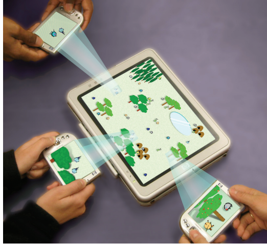
Figure 1: Mock-up of proposed demo game. Each handheld is displaying a detailed view of a portion of the environment that is displayed on the Tablet PC.