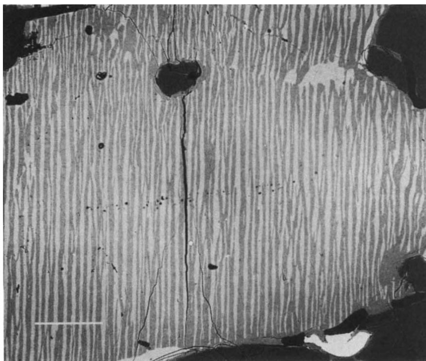
FIG. 2 Back-scattered electron image of a typical mesoperthite (sample ET24) showing the regular and continuous nature of exsolved plagioclase lamellae (darker bands). Quartz (dark) and rutile (light) are also present. Scale bar = 150\ \mu\text{m} .