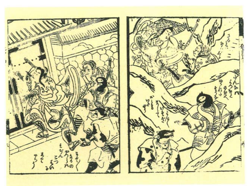
Figure 9: Illustration of Momotarō at the oni gate from Nishimura Shigenobu's Momotarō mukashibanashi . <sup>85</sup>

scene, with the hero adopting a mie from the aragoto style shows the influence of the Kabuki theater on the tale.