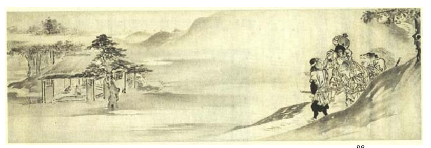
Figure 10: The final scene from Kōsū Koku's Momotarō emaki. 88

In addition to one scroll deleting the gate scene entirely there were additional changes in emaki versions that suggest the impact the values of the ruling class had on the tale. The final illustration of the Kōsū Koku scroll departs from the usual ending of having the hero meet his parents in the outdoors. Instead it shows him approaching his parent's house, while his parents are inside praying, presumably for their son's safety, at the family's Buddhist altar. [See Fig. 10] Ōta reads the emaki versions, in sharp