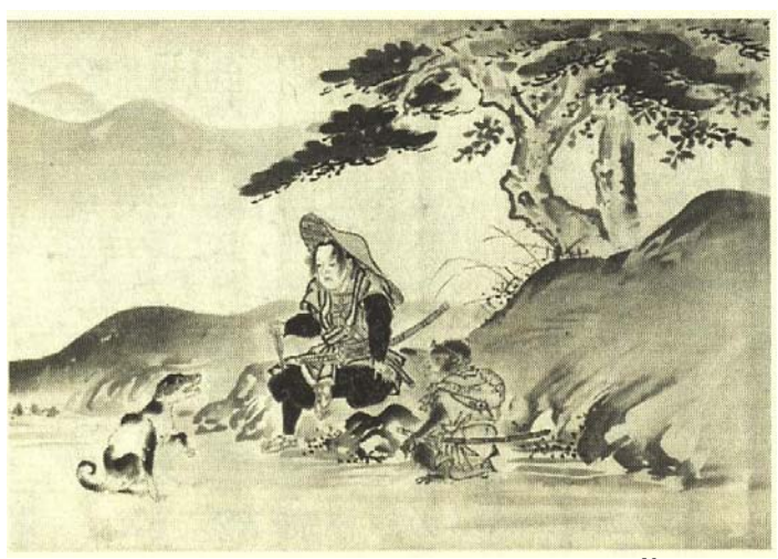
Figure 7: Scene from Kōsū Koku's Momotarō emaki . 80

Ōta bases this analysis on six extant Momotarō emaki dating from the mid-eighteenth to the mid-nineteenth centuries. Arranged from the earliest to the most recent and named for their presumed artists, the scrolls are as follows: Kōsū Koku (高崇谷), Ryūun (龍雲), Enshū (円洲), Kanō Naganobu (狩野栄信), Kita Busei (喜多武清), and Kanō Masanobu (狩野雅信). <sup>79</sup> They can be divided by visual similarities into two groups: the earlier Itchō line and the later Kanō line. The Itchō line scrolls include the first three scrolls listed and were all likely painted by disciples of artist Hanabusa Itchō (英一蝶) from around the end of the eighteenth century to the beginning of the nineteenth century. Itchō school artists illustrated both kabuki prints and emaki , so it is hardly surprising that this group of emaki have some visual similarities to both kabuki prints and to akahon , although there are differences as well.