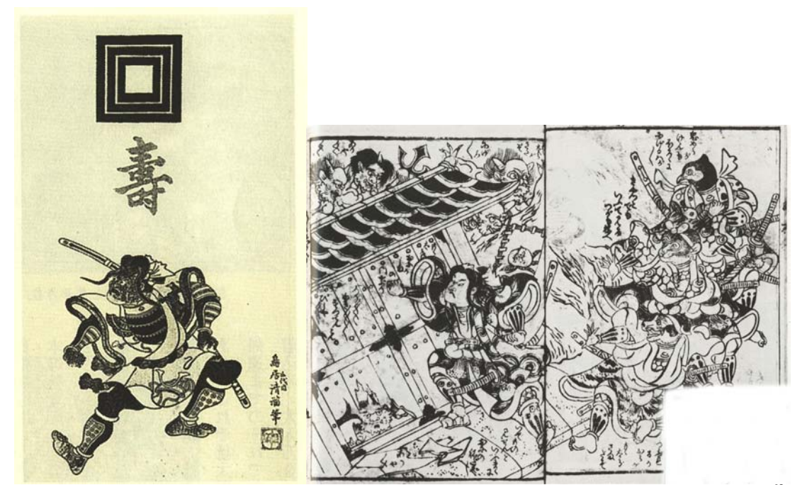
Figure 5: Actor Ichikawa Danjūrō II in a dramatic mie pose characteristic of aragoto style kabuki. 70