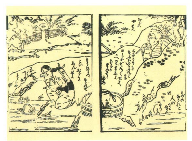
Figure 2: Second illustration from Nishimura Shigenobu's Momotarō mukashibanashi. 38

By the late eighteenth century when kibyōshi versions were flourishing it was more common for the woman to pick up a large peach from which a child was born directly. Namekawa has suggested that the change occurred because this later version was more appropriate for young children.<sup>39</sup> But why children, or their parents, grew more sensitive during the course of the eighteenth century is unclear. Considering the tale's move from akahon to kibyōshi suggests an alternative answer. Kibyōshi , even more than akahon , were geared toward adults, so consideration of children seems an unlikely reason for the change. But during the tale's migration through these two genres the influence of kabuki was increasingly important. A childbirth scene was unlikely to be popular in the theater. But a child bursting from a large stage prop peach has continued to be a tremendously popular part of the kabuki repertoire even to the current day.<sup>40</sup> The change to direct birth