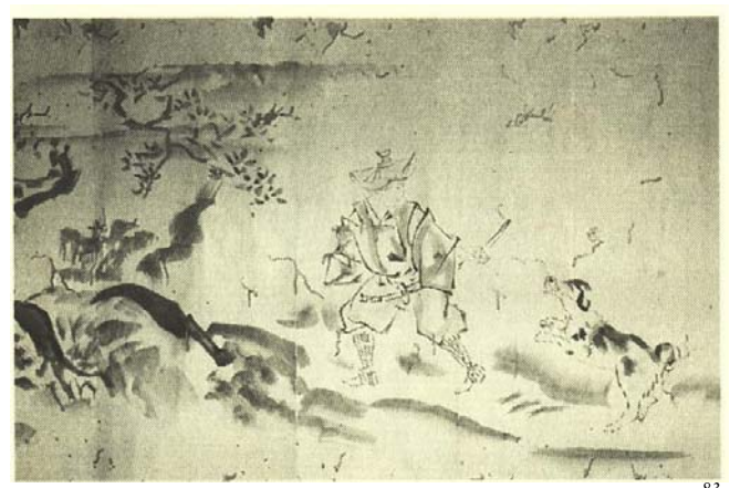
Figure 8: Scene from Kanō Masanobu's Momotarō emaki . 83

As Momotarō was imagined visually in the genres of akahon , kibyōshi , and emaki in each case it was slowly tailored to reflect the social image most acceptable to the status group for which that genre was produced. For townsmen this meant the dramatic yakko hero with whom they were familiar with from aragoto kabuki. As the tale migrated into the emaki form it slowly traded this image for one of an upper status samurai or even a member of the aristocracy. Interestingly, it was the upper status Momotarō of emaki that most clearly influenced modern illustrations of the tale from the 1890s onward.<sup>84</sup>