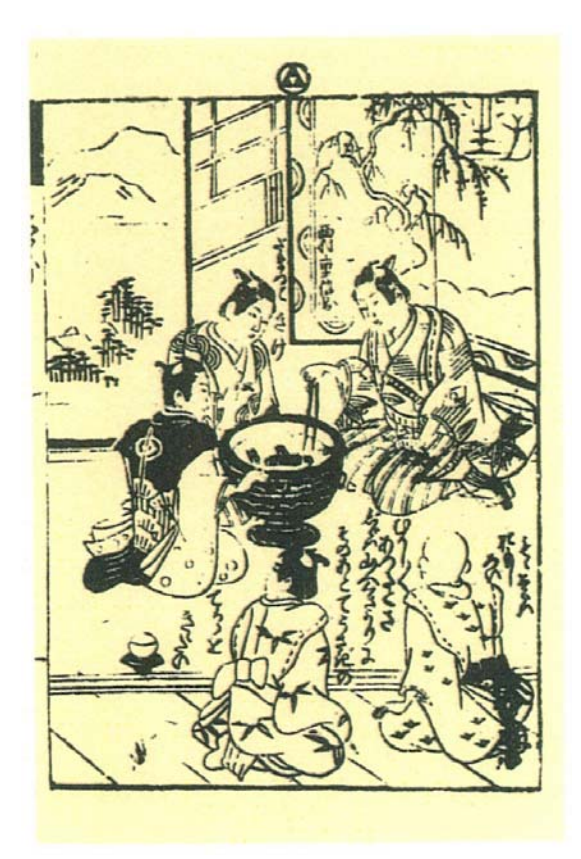
Figure 1: Opening illustration to Nishimura Shigenobu's Momotarō mukashibanashi . 35

In this illustration, Nishimura's written text both explicitly acknowledges the oral tradition and provides an example of how that tradition found its way into writing. Conditions of the oral narration shown are notably different from both the modern practice of parents reading tales to children and from Yanagita's presumption that tales were most authentically a rural phenomenon not connected to writing. From the men's