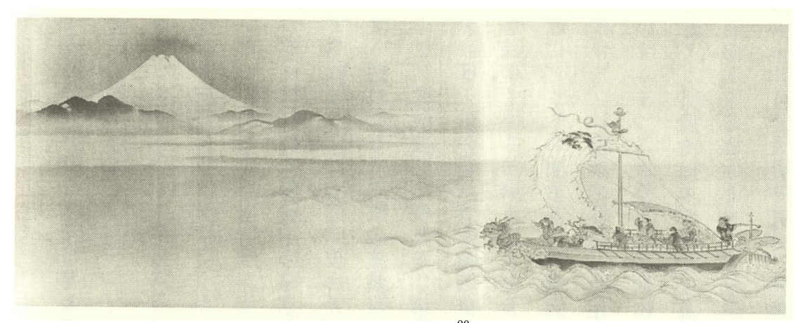
Figure 11: Scene from Kanō Masanobu's Momotarō emaki . 90

which includes one of the first instances when the nation was read into the Momotarō tale. While early illustrations rarely included recognizable landmarks, Naganobu included a scene of victorious Momotarō and his retainers returning by boat to a Japan in which Mt. Fuji dominated the landscape. [See Fig. 11]