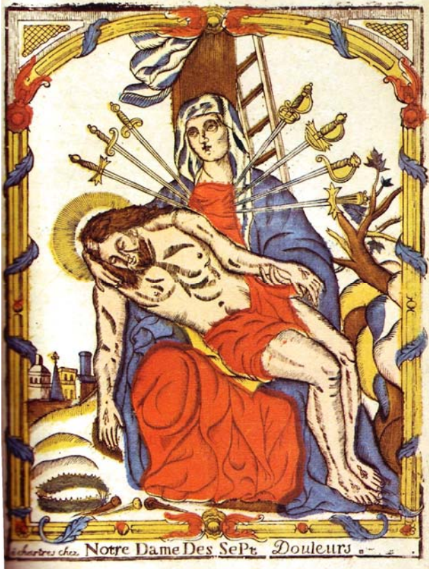
Figure 4: Chartres Cathedral, Jesus in the Arms of Mary , 1830