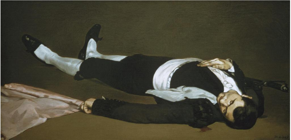
Figure 8: Edouard Manet, Dead Toreador , 1864