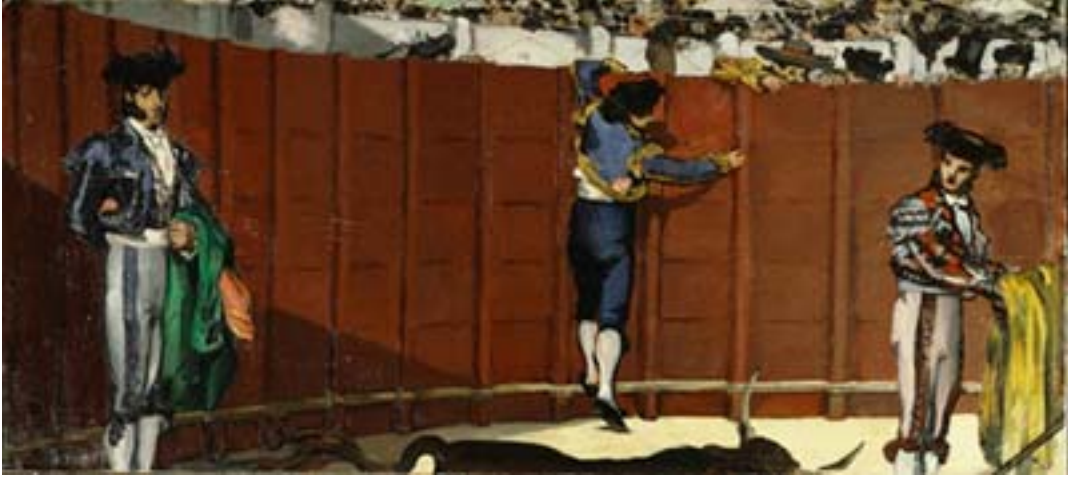
Figure 7: Detail, Manet's The Incident at the Bull Ring , 1864