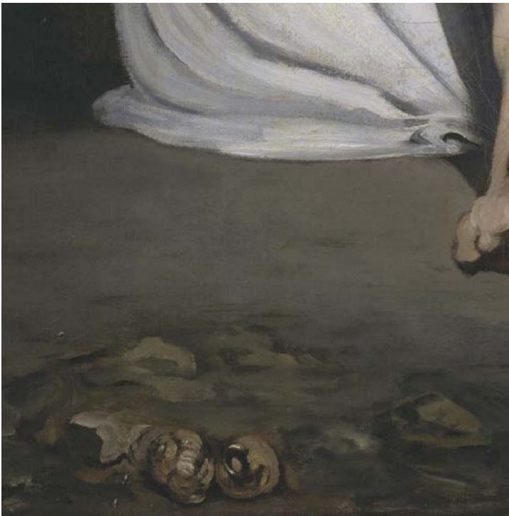
Figure 13: Detail, Manet's Dead Christ with Angels , 1864