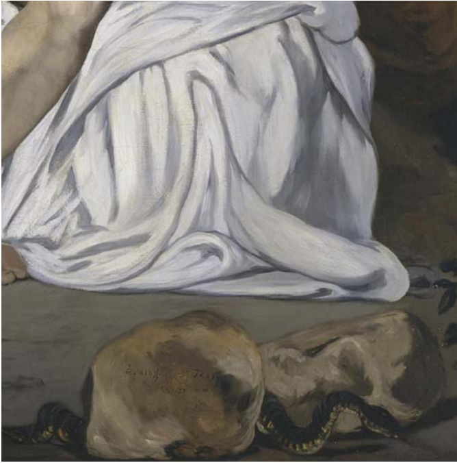
Figure 14: Detail, Manet's Dead Christ with Angels , 1864