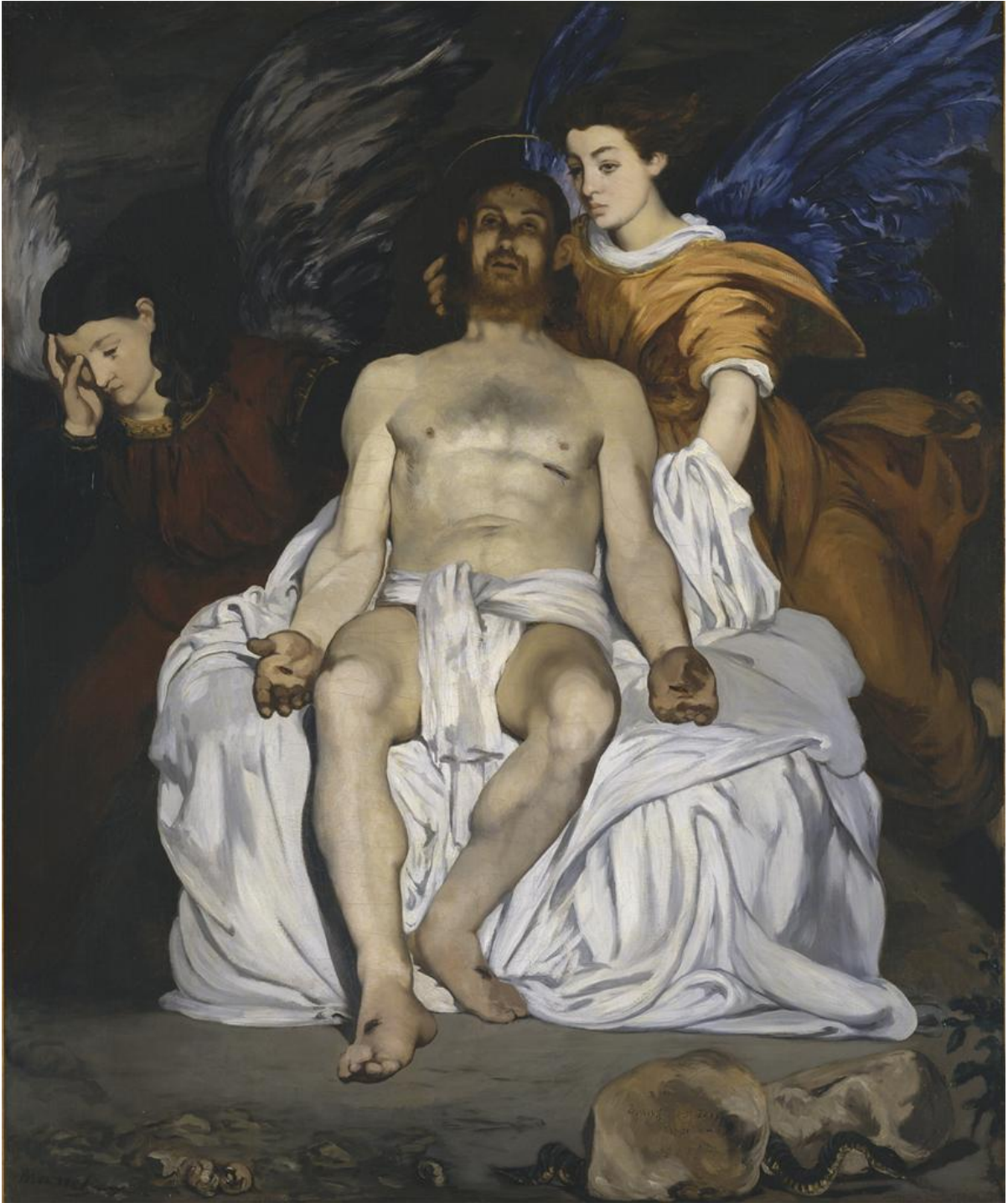
Figure 1: Edouard Manet, Dead Christ with Angels , 1864