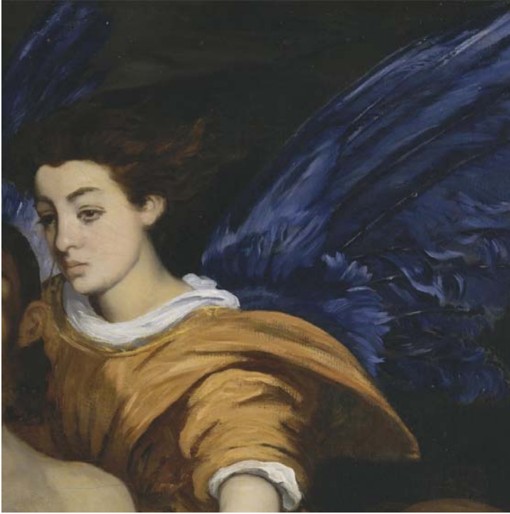
Figure 10: Detail, Manet's Dead Christ with Angels , 1864