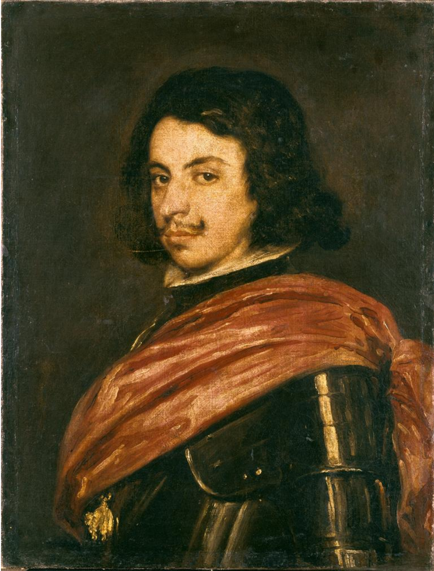
Figure 9: Diego Rodríguez de Silva y Velázquez, Portrait of Francesco I D'Este , 1638