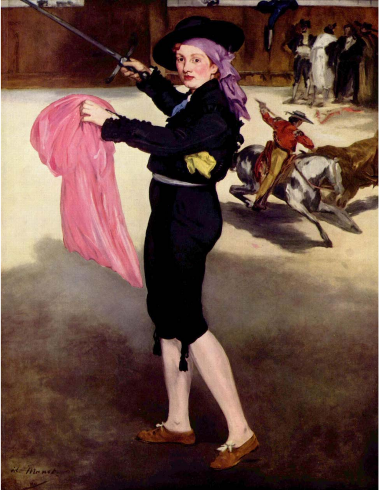
Figure 6: Edouard Manet, Mademoiselle Victorine as an Espada , 1863