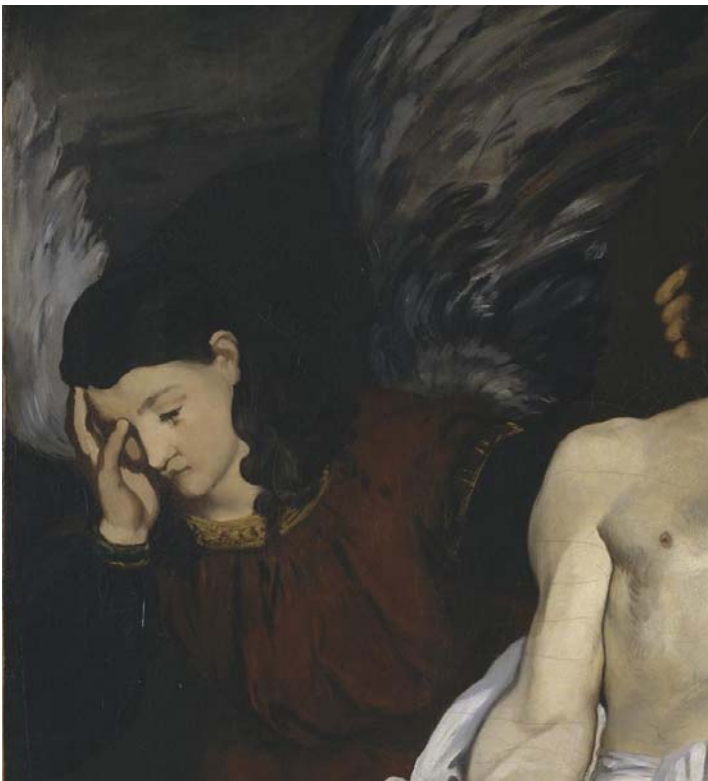
Figure 11: Detail, Manet's Dead Christ with Angels , 1864