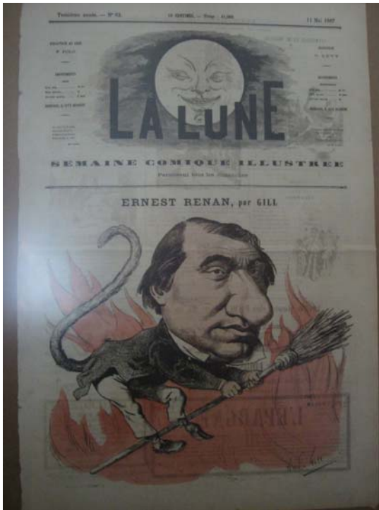
Figure 15: Andres Gill, Ernest Renan, par Gill from La Lune , 1867