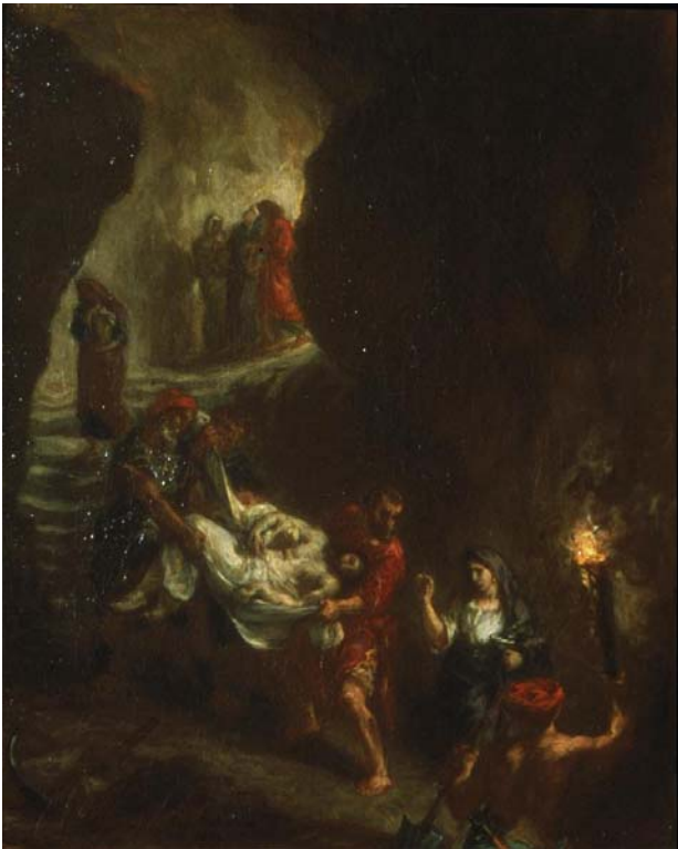
Figure 3: Eugène Delacroix, Descent into the Tomb , 1859