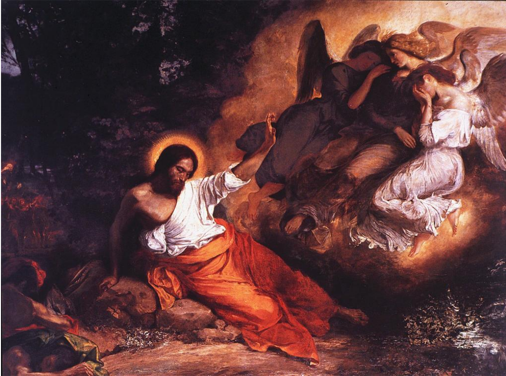
Figure 2: Eugène Delacroix, Christ in the Garden of Olives , 1827