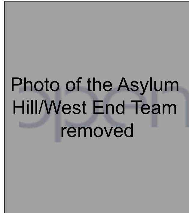
Asylum Hill/West End Team