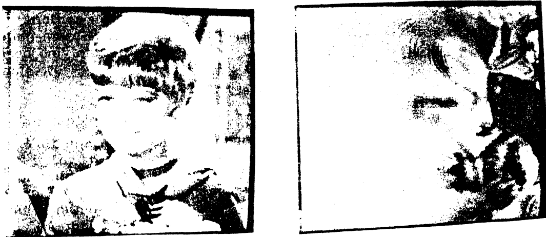
Figure 2 An image and its ECLM are shown in this figure.

image covered by a three pixel square around the point found from the inverse mapping. An indication of how this worked is shown in Fig. 1. The results of such a mapping are shown in Fig. 2. This method may be refined by assigning weights to the various areas of the square. In the future, if complex logarithmic mapping indeed becomes useful, it can easily be implemented in hardware.