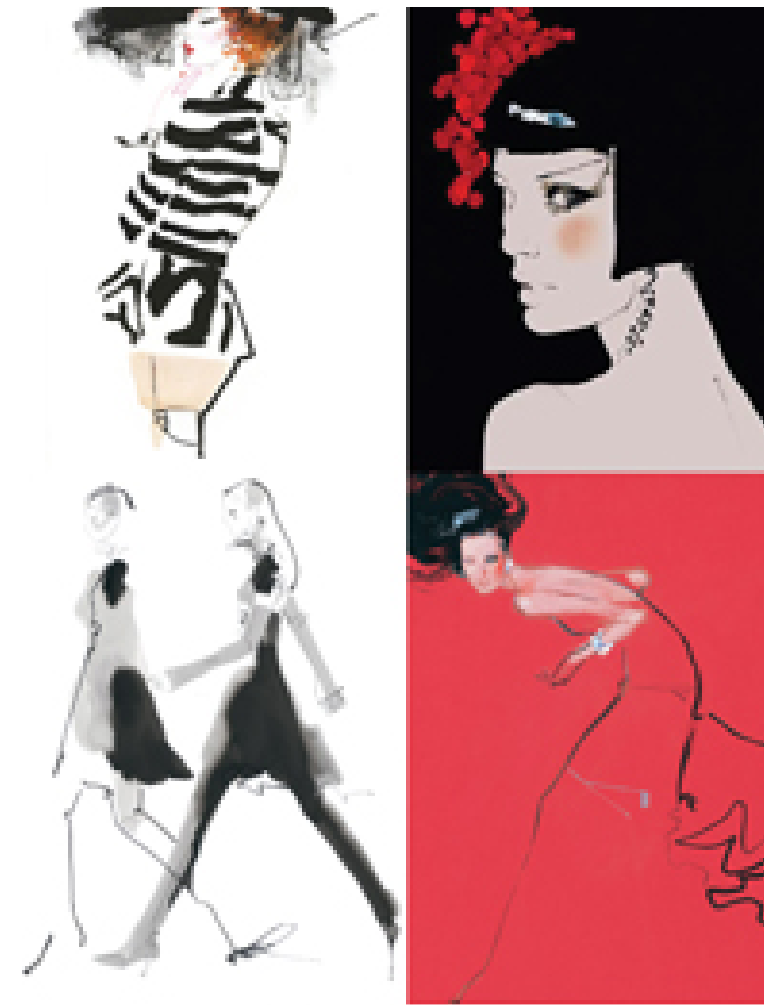
David Downton's Illustrations Media: Ink / Watercolor / Photoshop