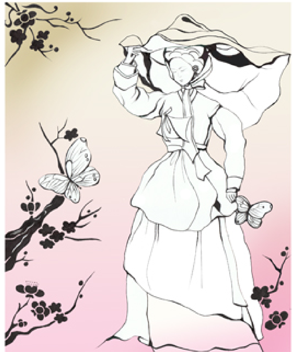
Illustrates traditional outdoor fashion for upper-class women Media: Pencil / Korean Ink / Photoshop CS3

The hanbok has been the Korean people's unique traditional costume for thousands of years. The beauty and grace of Korean culture can be seen through women's fashion styles. Before the arrival of Western-style clothing one hundred years ago, the hanbok was worn as everyday attire. Traditional Korean clothing has its roots extending back at least as far as the Three Kingdom Period (57 B.C. - 68 A.D.), as evidenced by wall paintings in tombs dating from the period. The Korean hanbok represents one of the most visible aspects of Korean culture. The top part called a jeogori is blouse-like with long sleeves with the men's version being longer, stretching down to the waist. Women wear skirts while men wear baggy pants. What is most significant about the clothing is its role to proclaim people's class and social status. Commoners wore white, except during festivals and special occasions such as weddings. Clothes for the upper classes were made of bright colors and indicated the wearer's wealth and pride. Various accessories such as foot gear, jewelry, and headresses or hair pins completed the outfit. The French call it "color of mystique" and fantasy." The hanbok , which is Korea's traditional outfit has one of the richest, most vibrant colors of all traditional Korean things.