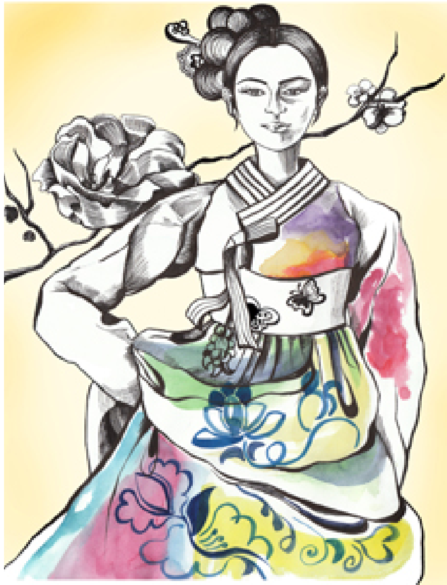
Illustrates a Korean geisha known for a fashionable and artistic entertainer Media: Korean Ink / Watercolor / Photoshop CS3

For my senior integrative project, I wanted to study how fashion, including clothing, jewelries, hair styles in an artistic, cultural, and social perspectives, developed and used, particularly in the Asian, Korean society by using different mediums, techniques, and styles to create illustrations of fashion, culture, and my ethnic background. What truly interests me is to see how different creative ideas and designs are combined with each other, built into a practical garments, and applied into our daily lives as a form of fashion. Fashion enthralls and attracts me, therefore, I hope to further study about fashion design and illustration including study of colors, designs, patterns, and fabrics through this Integrative Project.