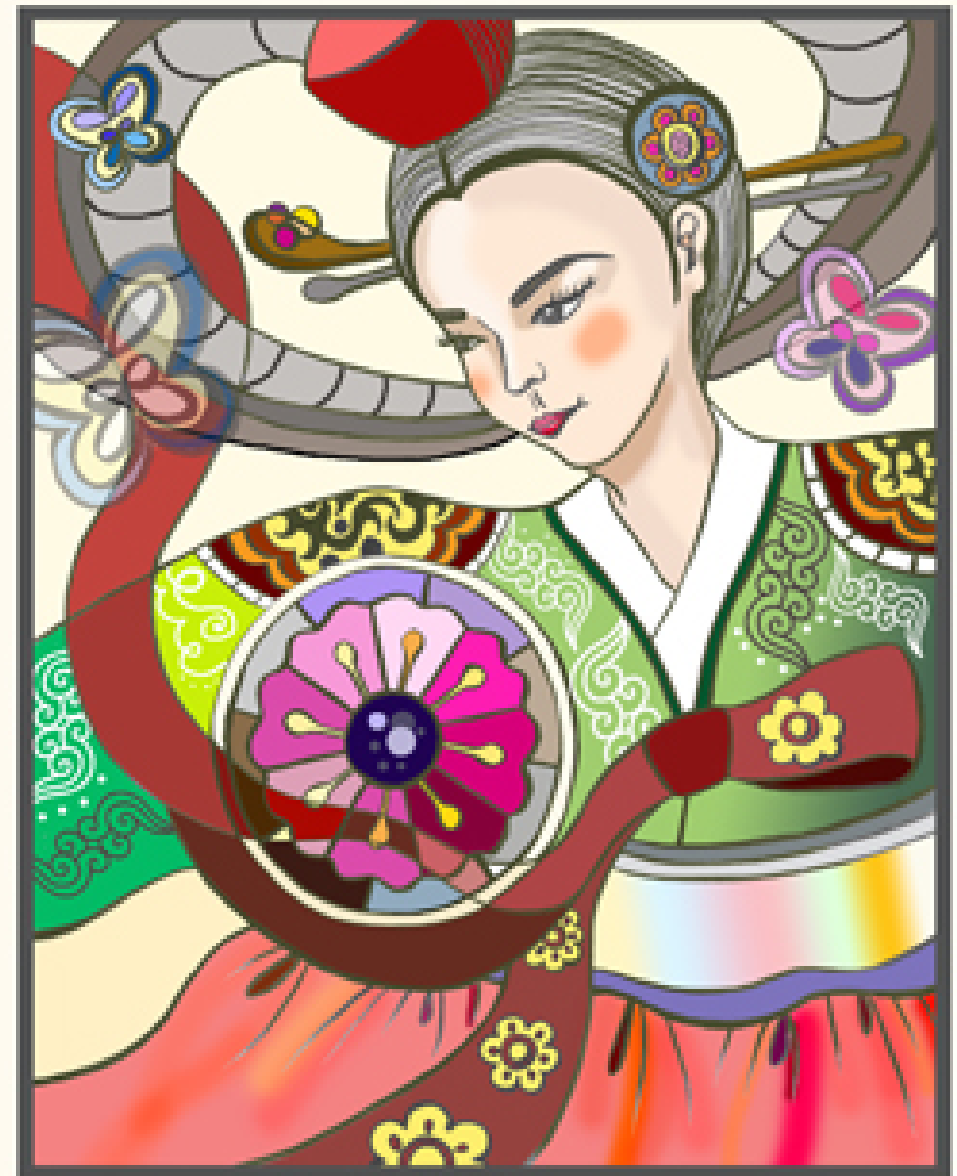
Illustrates a princess fashion in Chosun Dynasty (1392-1910)

The fashion and style are constantly changing. New ideas and phenomena demand new adjustments and styles. Occasionally an old style is revived, often with a somewhat altered meaning. As clothing has developed through ages, and has made most of its artistic progress, women's fashion has progressed tremendously.