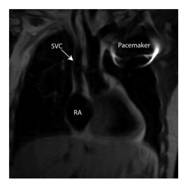
Figure 2. Double-inversion recovery MRI in the coronal plane demonstrating patency of the superior vena cava-right atrial junction in a 24-year-old male with DTGA s/p Mustard procedure with sinus node dysfunction and a single-chamber (atrial) endocardial pacing system. The generator can be seen located in left infraclavicular region.

and associated cooling mechanisms.<sup>9</sup> However, in vitro data would suggest that the heating of leads not surrounded by blood flow is negligible when using standard MRI protocols.<sup>14</sup> Our findings support these data as no clinically significant changes were noted in the parameters of the nine epicardial