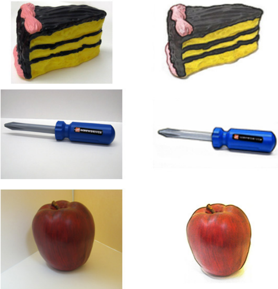
Figure 1. Sample object and picture versions of three target test items (cake, screwdriver, apple).