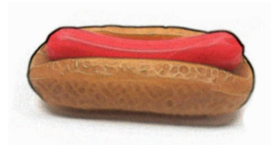
Figure 2. Sample target item with irrelevant, thematic, and taxonomic match (pizza with tiger, plate, and hot dog).