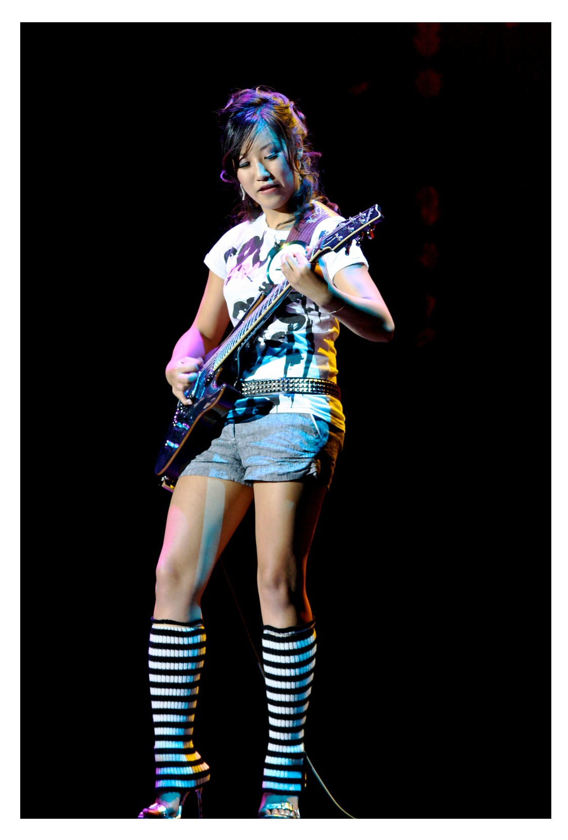
Figure 5.7. "Here..." A Miss Asian America Pageant contestant plays a classic rock solo on the electric guitar during the pageant's Talent Showcase.