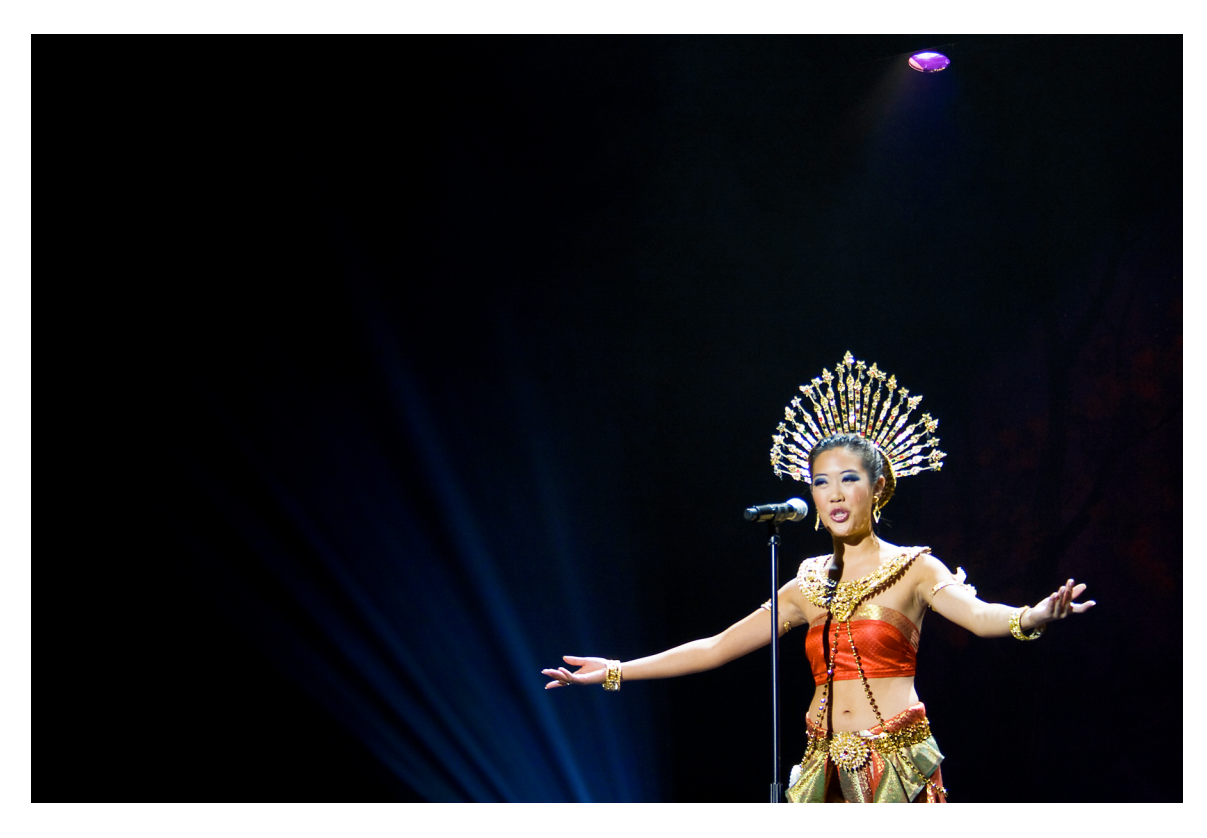
Figure 5.6. "Ethnic Mix!" The same contestant appears here, alone at the microphone. Although she is identified in the Miss Asian America Pageant program book as "Thai and Chinese," the nature of the Ethnic Costume competition requires that she wear only one outfit and therefore that she represent only one nation on the "map" of ethnicities performed in this portion of the pageant.