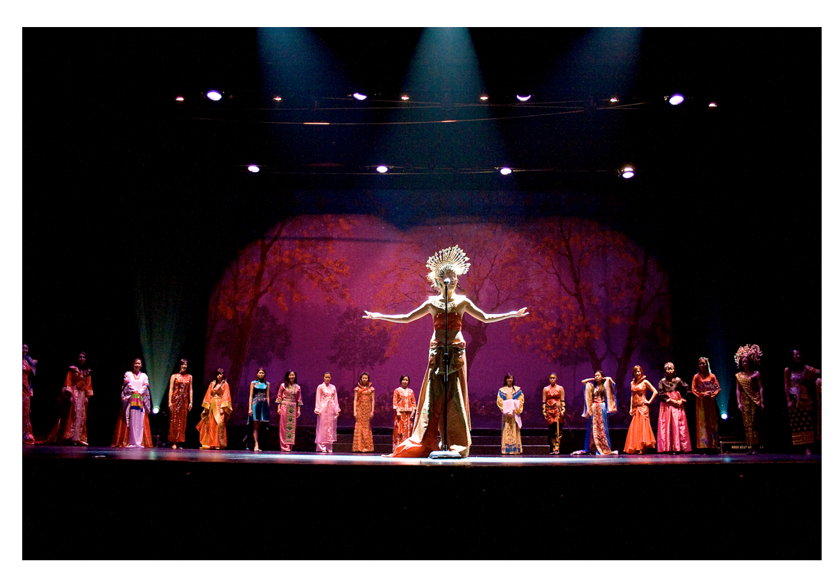
Figure 5.5. Ethnic Local. A contestant in the Miss Asian America Pageant introduces herself to the audience for the first time during the pageant's Ethnic Costume competition. The remaining contestants stand arrayed behind her, wearing traditional garb to represent various Asian nations. Together, the contestants create an embodied "map" of Asian America based on Asian ethnicities rather than on American geography.