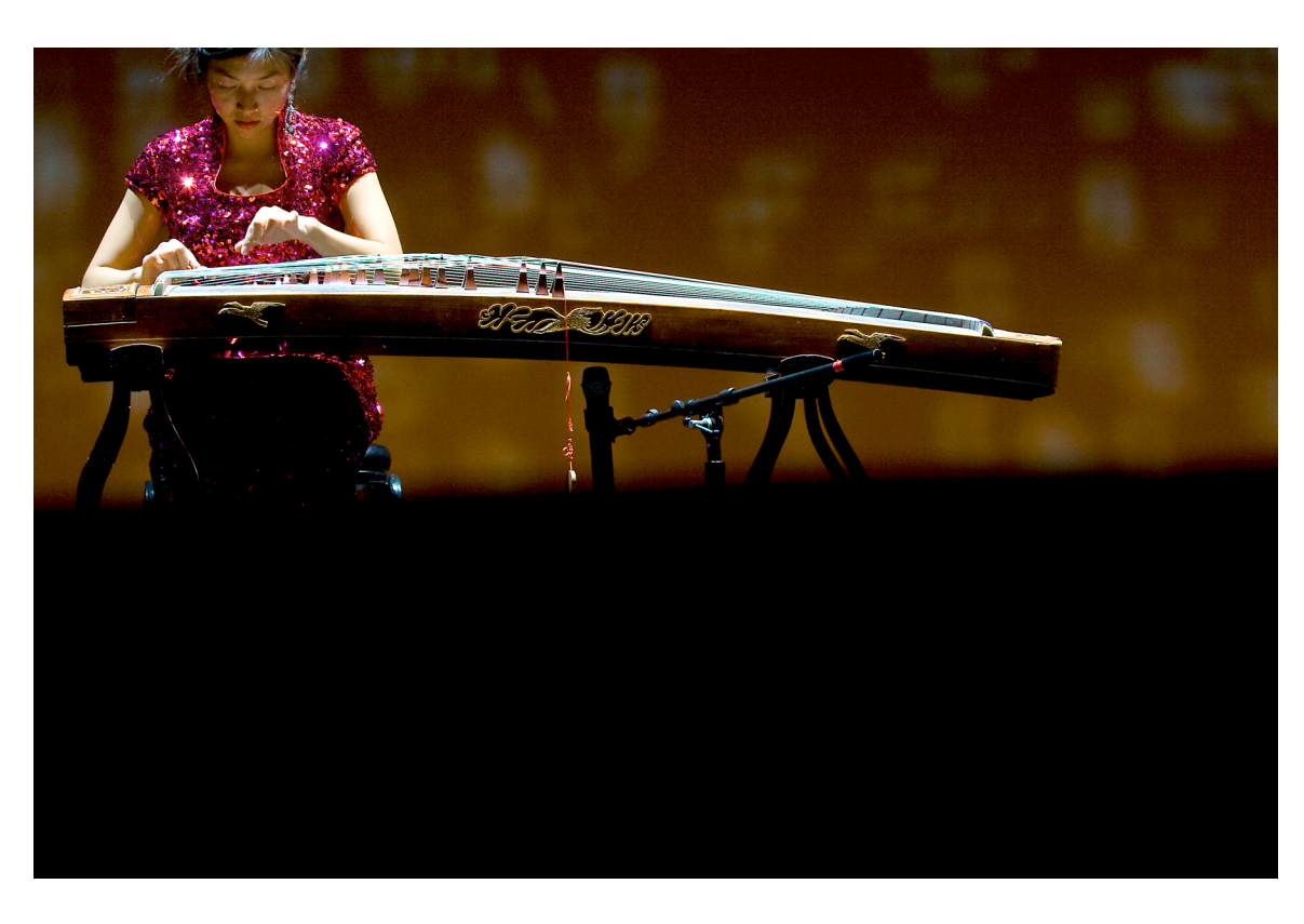
Figure 5.8. "...and There." Another contestant plays a solo on the ghuzeng , a Chinese string instrument, during the Miss Asian America Pageant Talent Showcase.