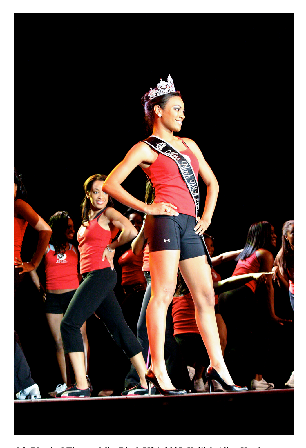
Figure 5.3. Physical Fitness. Miss Black USA 2007, Kalilah Allen-Harris, poses onstage during the Physical Fitness competition on the final night of the 2008 pageant. The contestants behind her wear matching outfits as they perform a choreographed group routine. Whereas they actually appear gym-ready, Allen-Harris seems less so. She has accessorized her physical fitness outfit with a pair of black high-heeled pumps.