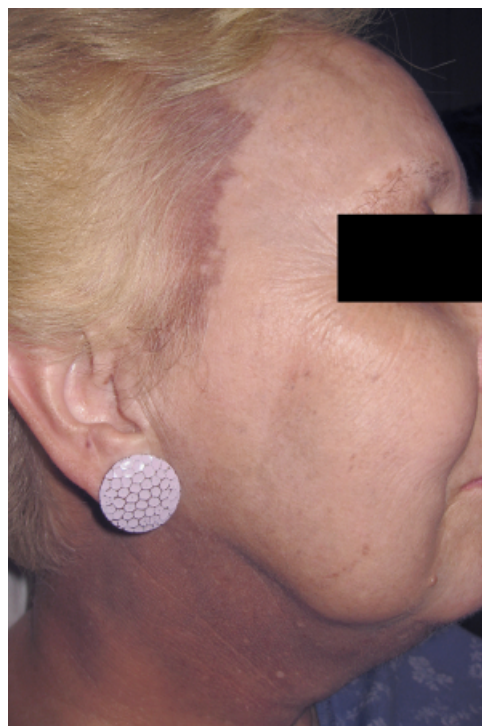
Figure 3. Clinical improvement with clearance of pigmentation on the right side of the face. Note the contrast between the patient's normal skin color and that of untreated skin on the right side of the neck and at the hairline.

Quadrants of the patient's facial skin and neck were subsequently treated with the Q-switched alexandrite laser (spot size 2–3 mm, fluence 8–10 J/cm 2 ) on four occasions over a 6-month period, with marked clearing of treated skin (Figure 3). After three treatments, several dark blue macules measuring 2 to 3 mm in diameter were noted in focal areas along the left jaw line and temple. The sites of paradoxical darkening resolved after treatment with additional Q-switched alexandrite laser therapy. The patient is currently scheduled to undergo similar treatment of the affected areas of her hands. After clinical resolution of the hyperpigmentation, our patient's psychological status improved substantially, and she and her husband report that she has been able to return to her normal social activities (Figure 4). Given our patient's resistance to discontinuing imipramine, she will probably require further laser treatments in the future to maintain the striking