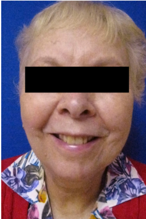
Figure 4. Near-complete resolution of imipramine-induced dyspigmentation.

improvement already seen, but there has been no recurrent dyspigmentation of the face for 1 year.