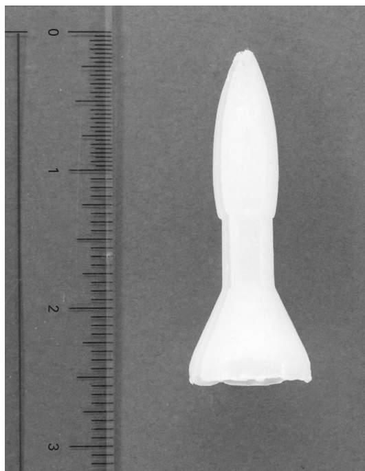
Figure 1 Caption to follow.