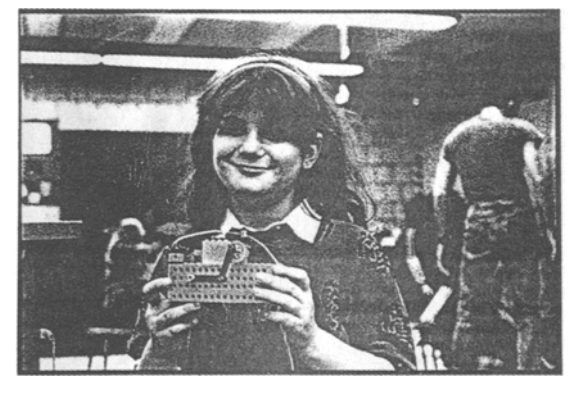
FIGURE 2. Student Showing Off Lego-Logo Design

Writing is a design activity, as such it deserves a CAD system. Moreover, writing in the context of an Acid Rain-like project is a collaborative activity. That too deserves technological support. Systems such as EarthLab and CSILE are exploring how to scaffold learners as they engage in such writing activities [3, 7]. For example, CSILE presents on-screen templates that provide a framework for students writing lab reports, as well as onscreen buttons that provide explicit coaching, e.g., in order to help students better index their reports so they are more accessible to other students, one such button raises the question "How will other people want to look for your document?" Such technological support surely goes beyond the "stone on stone" situation!