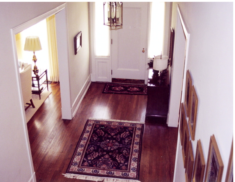
The original floors of quarter-sawed oak were exposed and refinished

We began by removing the carpets from all of the floors on the first and second floors. All of the floors were wood. The library and the dining room were the original quarter-sawed oak and were in beautiful condition. Of course there was some damage done when removing the old radiators along with some water damage, but this could easily be repaired. The living room was not quarter-sawed oak, but was beautiful none the less. The president's study was a wide board pegged wood with a little water damage, but repairable. The second floor wood was not as grand but in satisfactory condition for refinishing. The carpet on the third floor was in good condition, and we decided to leave it in place.