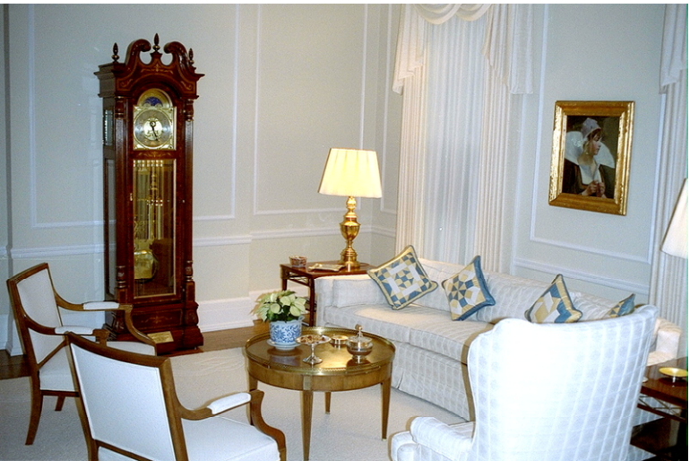
We decorated the house with art on loan from the Museum of Art

The drapes had been in place for many years. They were also water and sun damaged and needed to be replaced, again within budget. The renovation was completed during the summer, but it took several months before the drapes, furniture and rugs arrived. Through careful budget control and considerable effort, we were able to refurbish the entire house with the money that was going to be spent to replace the turquoise carpet.