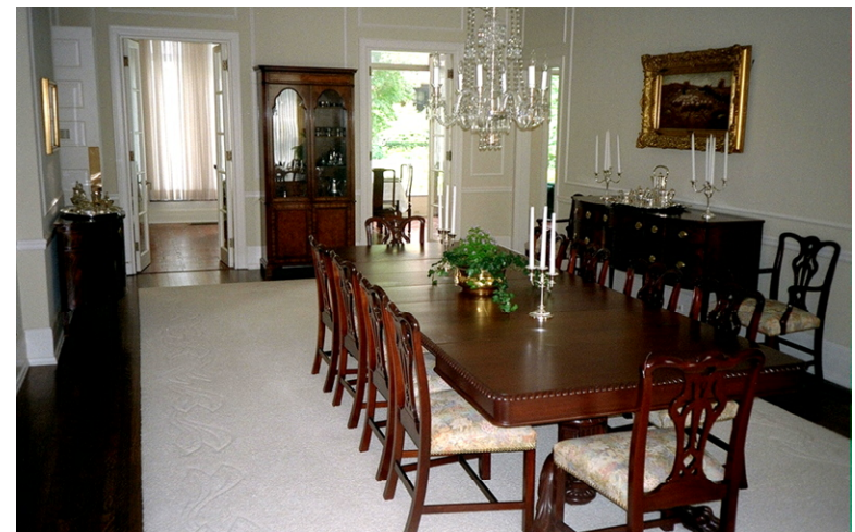
We repaired, replastered, and painted the walls.

The drapes had been in place for many years. They were also water and sun damaged and needed to be replaced, again within budget. The renovation was completed during the summer, but it took several months before the drapes, furniture and rugs arrived. Through careful budget control and considerable effort, we were able to refurbish the entire house with the money that was going to be spent to replace the turquoise carpet.