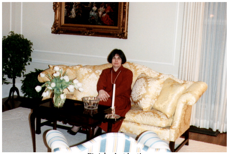
Finished at last!