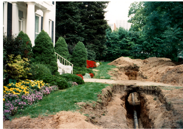
The front yard was not much better ...