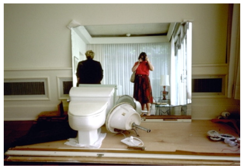
And look what I found on the dining porch!