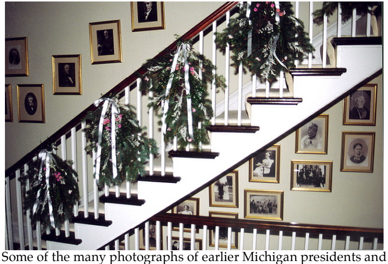
Some of the many photographs of earlier Michigan presidents and their families that we framed and displayed throughout the house (shown at Christmas time in the President's House)

It was a unique experience living in a house characterized by such an extraordinary history. It is quite a challenge to make such a landmark a home for your family, especially since you know that you are only visiting for the brief time that you are in the presidency.