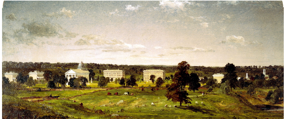
The Cropsey painting of the original campus in 1847 with two of the faculty houses shown on the left

The President's House of the University of Michigan is the oldest building on the University campus. It is one of the original four houses constructed to house faculty when the University moved from Detroit to Ann Arbor in 1837.