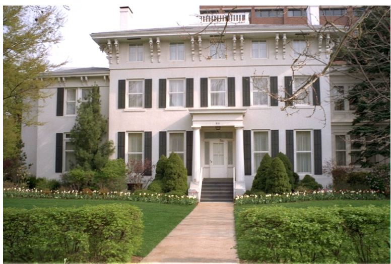
ThePresident's House during the Shapiro years

With the help of Virginia Denham, all of the Shapiro's furniture was moved over to furnish the upstairs of the President's House and to fill in the downstairs. The house was left essentially intact. The carpets and drapes remained. The only changes were to replace the old wallpaper in the dining room which was very old and reupholster the dining room chairs. Some changes were also made in the master bedroom since pictures had been removed from the walls and some painting was necessary.