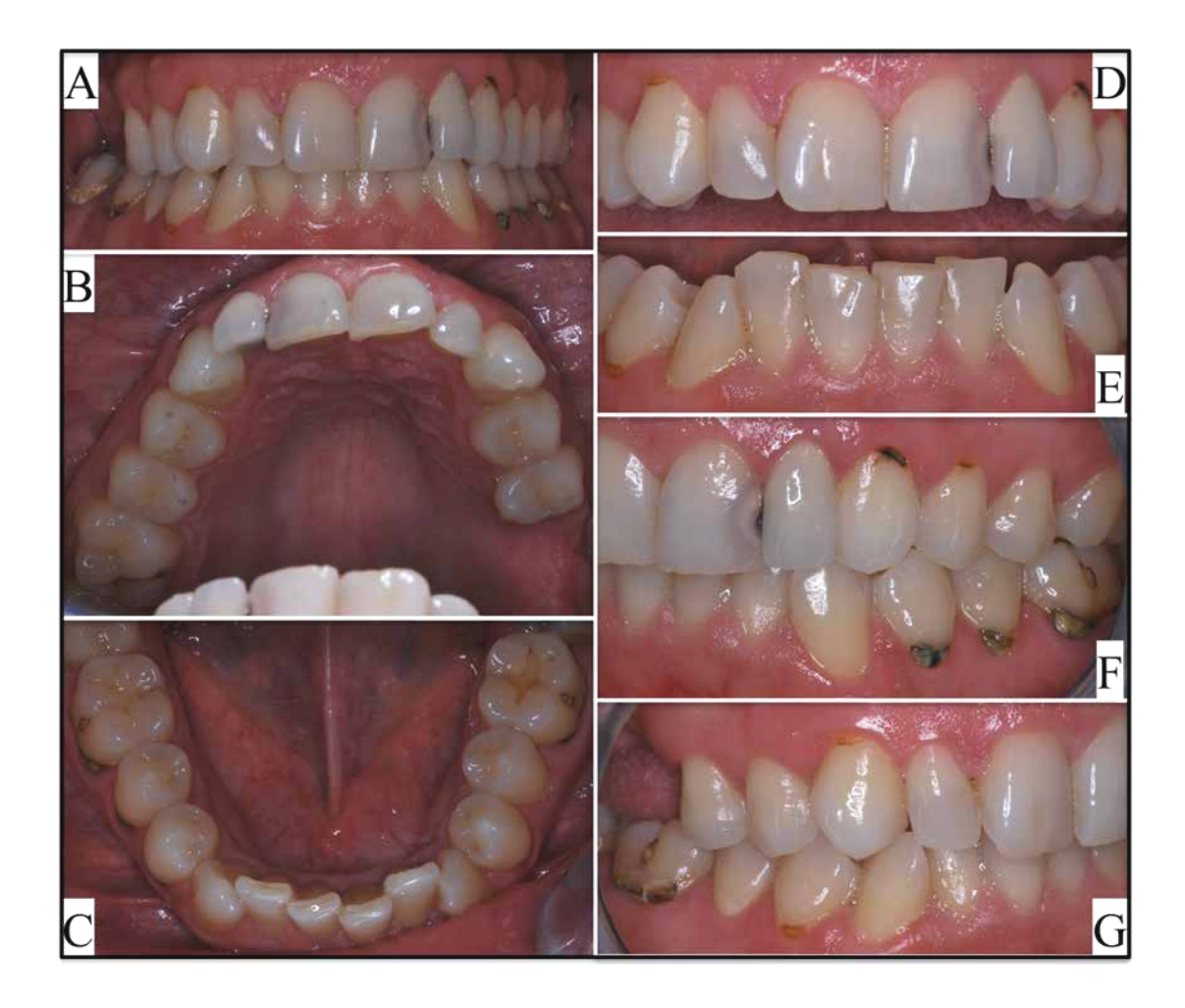
Fig. S2. Oral photographs of the unaffected father (II:4) of family 37 ( AMELX , p.P70T). A: frontal; B: maxillary occlusal; C: mandibular occlusal; D: maxillary facial; E: mandibular facial; F: left buccal; G: right buccal. The enamel shows normal thickness, texture and color, although dental caries is evident.