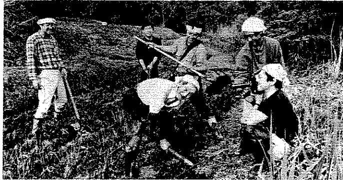
shooting Living on the River Agano