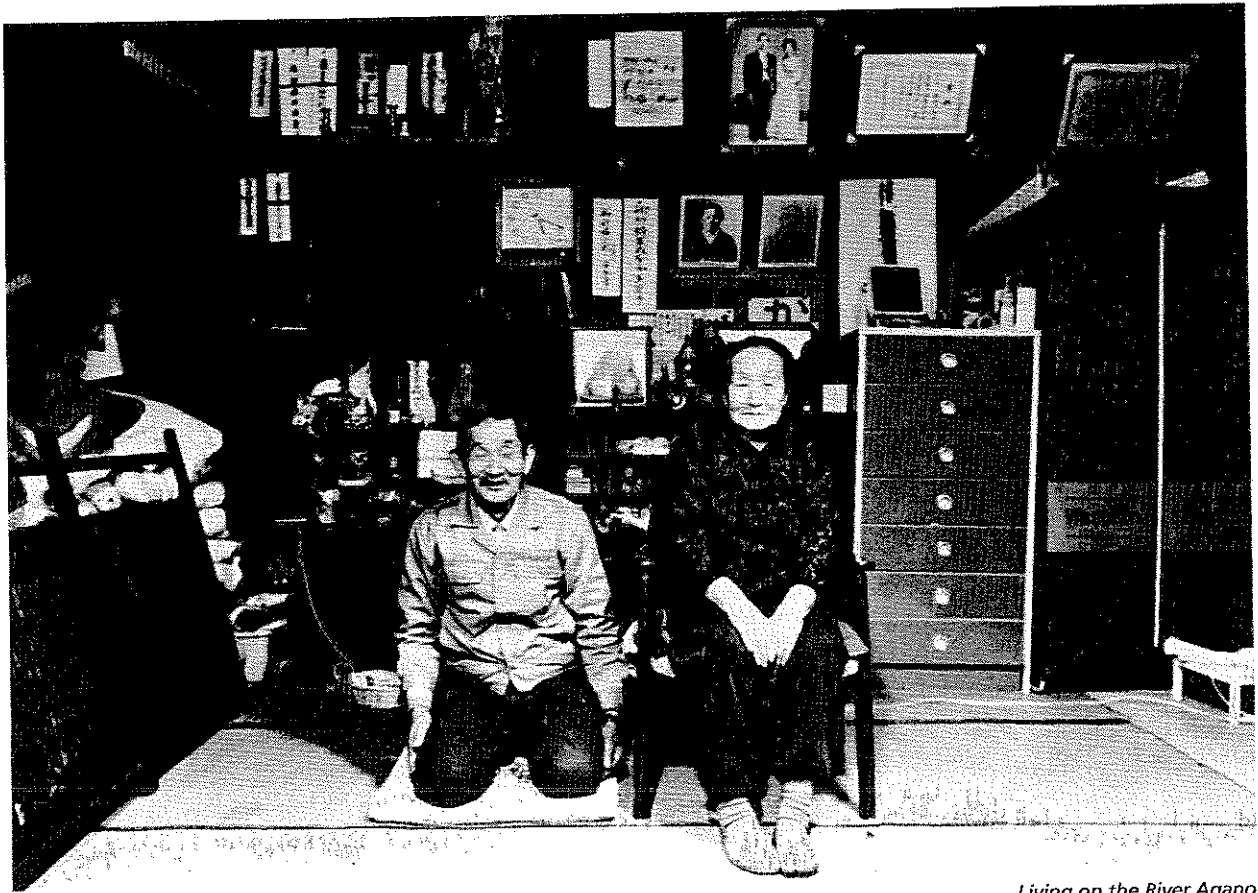
Living on the River Agano

about a million dollars. So our thinking at the time was to avoid ending up like Ogawa by not borrowing, and to try to raise money through donations as much as possible. That's why it became necessary to set up a Production Committee, like a sort of citizens' organization (dedicated to raising funds).