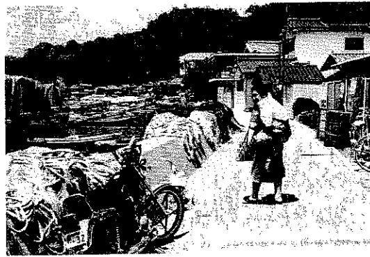
The Innocent Sea