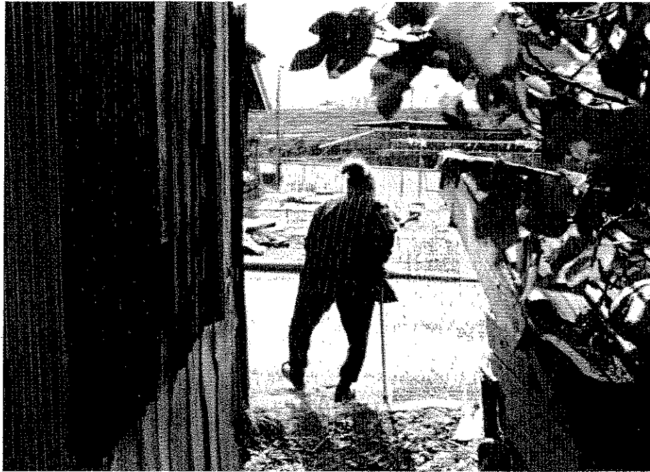
Memories of Agano