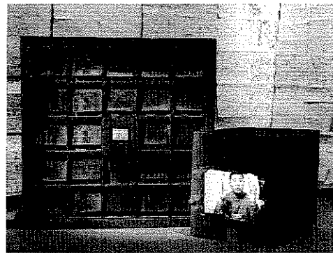
Artists in Wonderland

if you ask me if I have thought about those kinds of things, the truth is I have. All twenty-three year old boys are thinking about getting closer to girls.