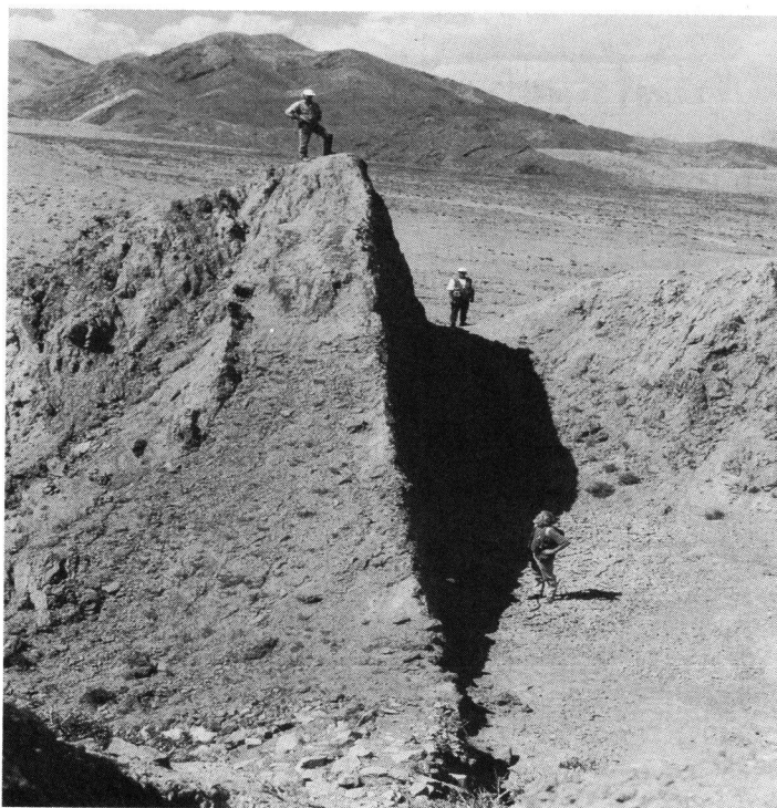
Fig. 1. Photograph looking west-northwest along a segment of the Gobi-Altay rupture, where 6 m of left-lateral and 5 m of vertical slip occurred along an unusually well-preserved fault surface. One workshop participant stands near the top of an offset ridge, another is at its upslope continuation, and another is at its base.

The Gobi-Altay earthquake of December 4, 1957, known as the Ikh Bogd earthquake in Mongolia [Florensov and Solonenko, 1963, 1965], stands out as one of the great intracontinental earthquakes. Extraordinary preservation of the surface rupture (Figure 1) allows