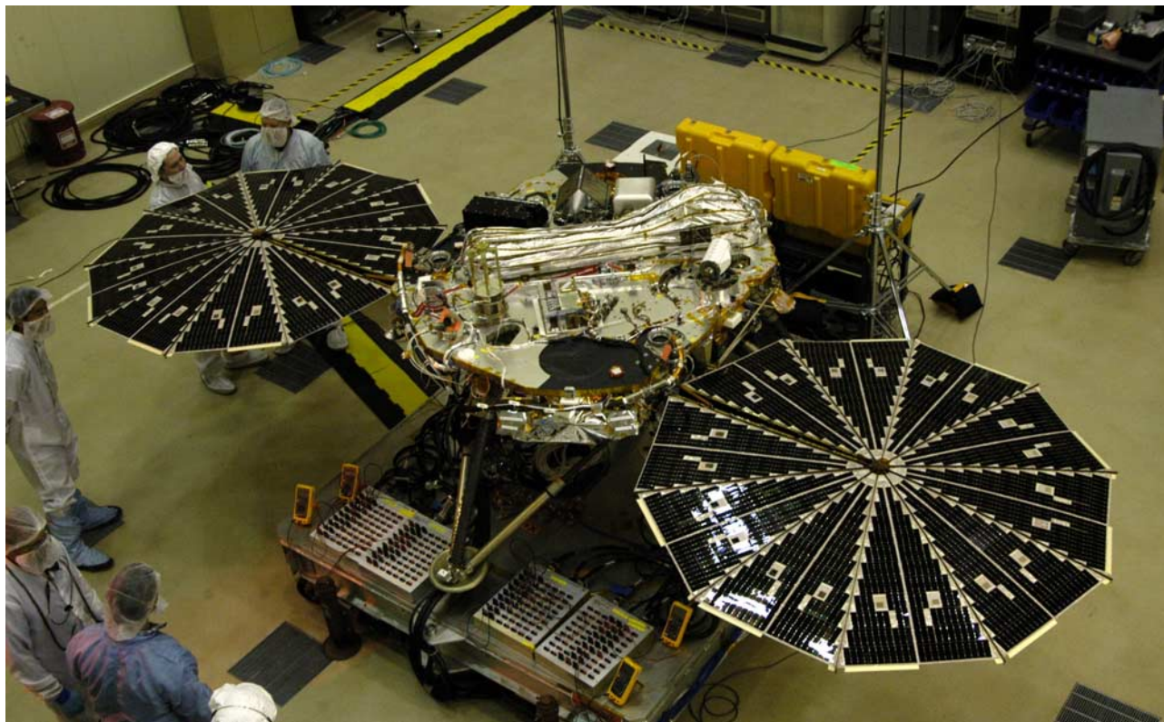
Figure 1. The spacecraft in its landed configuration during the assembly and test phase of the mission. It is undergoing a test of the solar panels in the Lockheed Martin clean room. The Robotic Arm crosses the middle of the deck under the biobarrier.

heritage of the 2001 Mars lander, even though sister boards and identical systems were flying on Odyssey , or had been successfully used on Genesis , Stardust , or Mars Global Surveyor . Many subsystems had flown to Mars on the twin spacecraft Mars Polar Lander and Mars Climate Orbiter . Clearly, the landing systems on Mars Polar Lander required a detailed reengineering, but what about the other systems that had performed nominally, in some cases for years beyond their design limits?