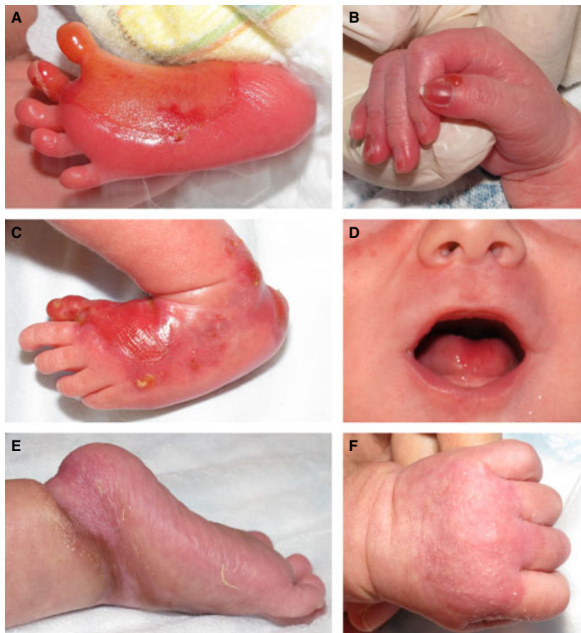
Figure 1. Appearance of the skin lesions. Patient 1: (A) large bulla on the right foot and (B) vesicle on the right thumb at 3 days of age. (C) Patient 2: erosion involving the dorsum of the left foot with the loss of the great toenail at 5 days of age. (D) Patient 2: tongue erosion at 16 days of age. Patient 3: (E) milia and hyper- and hypopigmented patches on the left ankle at the site of a previous lesion and (F) an erythematous patch with milia on the left hand at 5 weeks of age.

current physical examination. Punch biopsies of intact blisters on the left knee were performed and submitted for hematoxylin and eosin (H&E) staining and IF. H&E staining showed a paucicellular subepidermal vesicle, with periodic acid-Schiff–positive basement membrane in the floor of the vesicle, most consistent with EB of the junctional type. IF showed localization of laminin and type IV collagen along the intact DEJ. Type IV collagen was expressed solely in the roof of the central subepidermal microvesicle, consistent with sublamina densa split and dystrophic EB. Type VII collagen was detected in the roof but not the floor of the microvesicle, with prominent focal granular deposits of collagen VII in the cytoplasm of epidermal cells and interrupted staining along the DEJ (Fig. 2A), compared with linear staining in a healthy skin control (Fig. 2D). The presence of type VII collagen excluded severe generalized recessive dystrophic EB, previously known as Hallopeau–Siemens. Type XVII collagen and \alpha 6 and \beta 4 integrins were