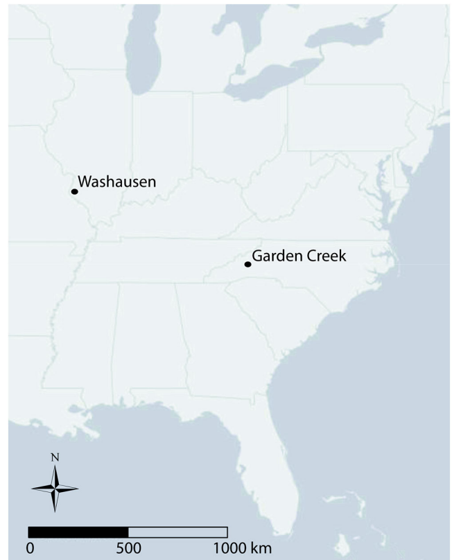
Figure 1. Locations of the Washausen site (11Mo305) and the Garden Creek site (31Hw8).

Below, the multiple contributions of geophysical survey to traditional archaeological strategies (and vice versa) are demonstrated by work at two very different mound sites: the transitional Mississippian Washausen (ca. AD 975–1050) site in the American Bottom, IL; and the Middle Woodland (ca. 300 BC to AD 600) site of Garden Creek in the Appalachian Summit, NC (Figure 1). Archaeological investigations at each site began with extensive geophysical surveys to encompass