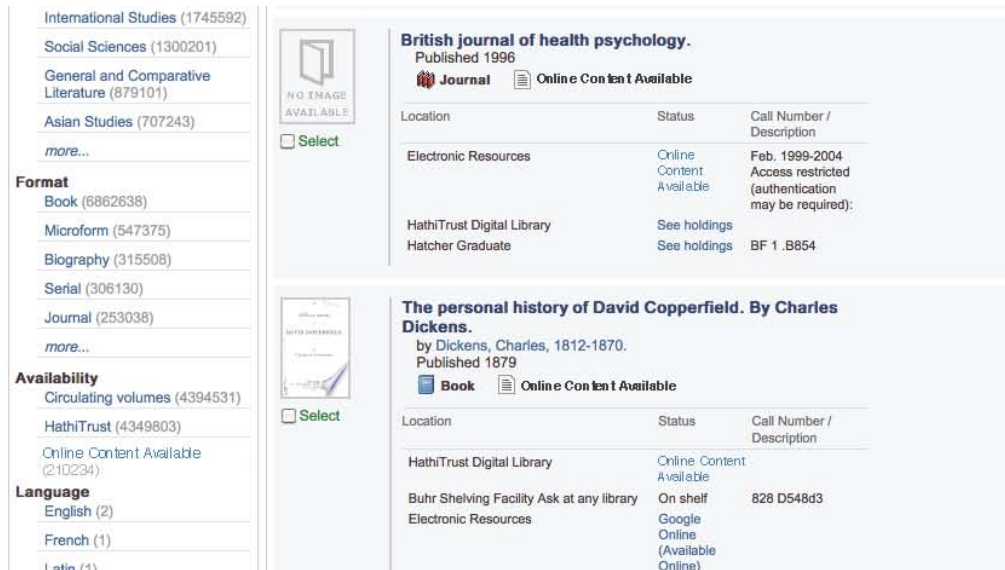
Partial image of 1 of the 4 screenshots used for guerilla test, testing the label “Online Content Available”

Within each set of search results, the label in question was highlighted as to draw attention to the difference between the screenshots. The varying levels of availability for different types of items within the set of search results were briefly described to the participants, and participants were asked to choose which label best described all the situations they saw.