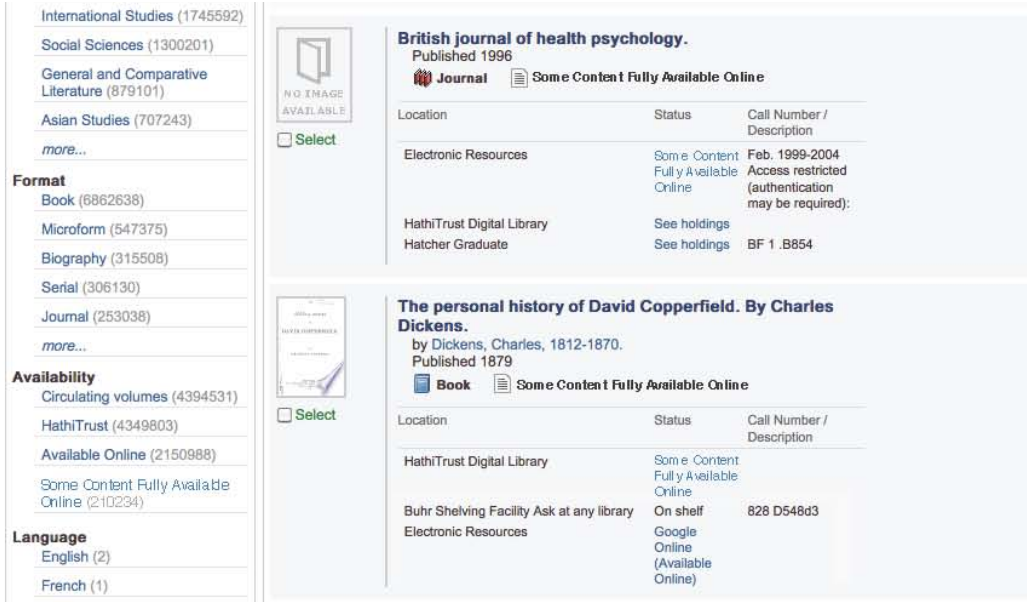
Partial image of another screenshot used for guerilla test, testing the label “Some Content Fully Available Online”

The task force group divided into three teams, with each team recruiting 5 participants (undergraduates, graduate students, and faculty) and 1-2 librarians each. Participants were recruited in various locations around campus, and were offered a small incentive of $2 in Munchie Money.