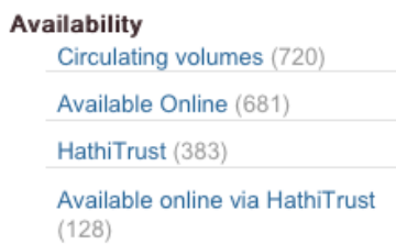
Example within "Narrow Search" Column

The "available online" label appears also in Mirlyn as clickable text under the "Availability" search narrowing option in the "Narrow Search" column of search results pages and as the text of the hyperlink to the online version of an item which appears in search results and Mirlyn record web pages.