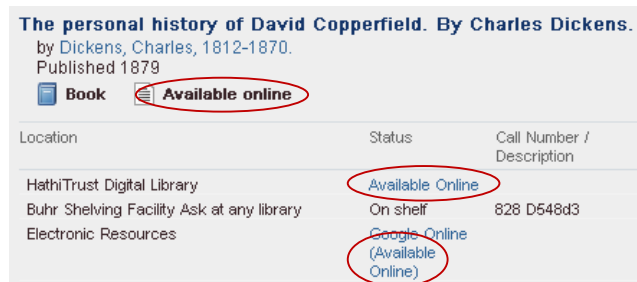
Example of "available online" label within Mirlyn record

The earlier heuristic evaluation of Mirlyn conducted by the usability task force, and feedback from both staff and patrons indicate that the meaning of the "available online" label can be confusing. Reference librarians report that patrons are often frustrated when items described as "available online" are not, in fact, available (the particular issue needed might not be available in full-text, or the patron might be looking at something that is "search-only").