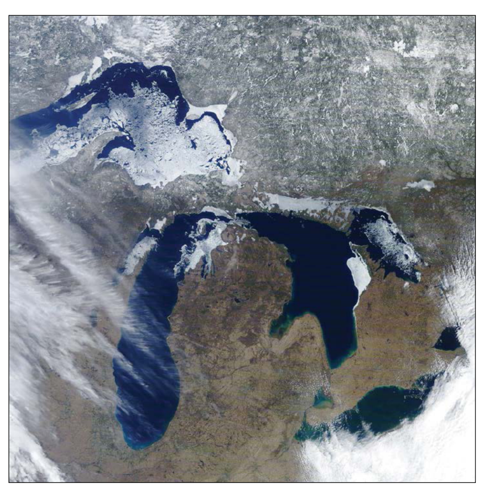
Fig. 1. Satellite image of the Great Lakes from 23 April 2014 showing the areal extent of ice cover across the upper Great Lakes.

The recent extreme ice and temperature observations raise compelling questions about not only the extent to which the Great Lakes might transition to a new hydrologic regime characterized by cooler lake temperatures and rising water levels but also the extent to which such a regime might persist as the climate system evolves [ Collins et al. , 2010].