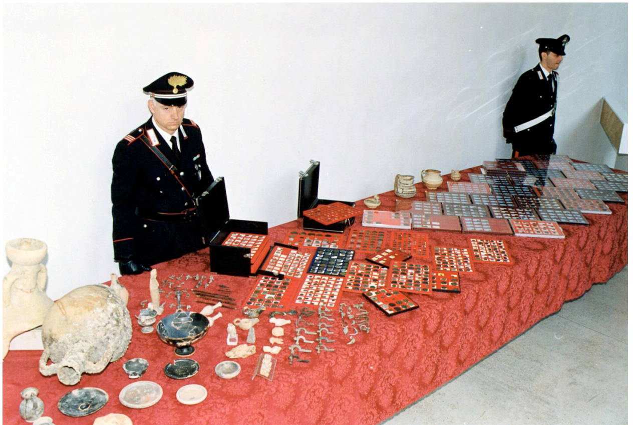
Image 2: Officers from the Syracuse office of the Tutela del Patrimonio