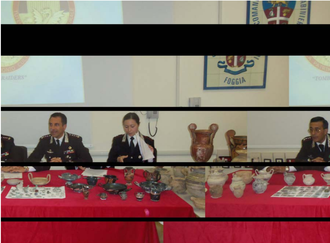
Image 3: Press conference announcing the success of “Operazione Tomb Raiders”