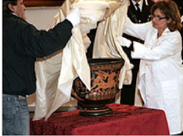
Image 1: Unveiling the Euphronios krater at the Ministry of Culture