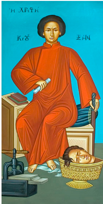
Figure 7. “The servant of Justice and student of History, the poet and teacher, Qiu Jin, beheaded by the barbarians.” http://www.prosopa.eu/person_en.php?id=jin . Exhibited in the group Prosopas by the Port of Piraeus Organization at the 2004 Olympic Games.