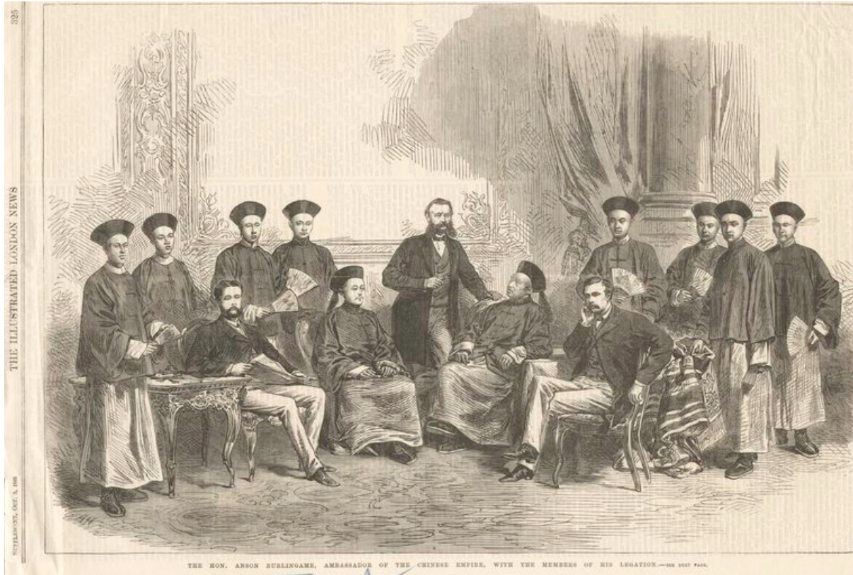
Figure 5: “The Hon. Anson Burlingame, Ambassador of the Chinese Empire, with the members of his legation” The Illustrated London News , Supplement, Oct. 3, 1868, pg. 325.*