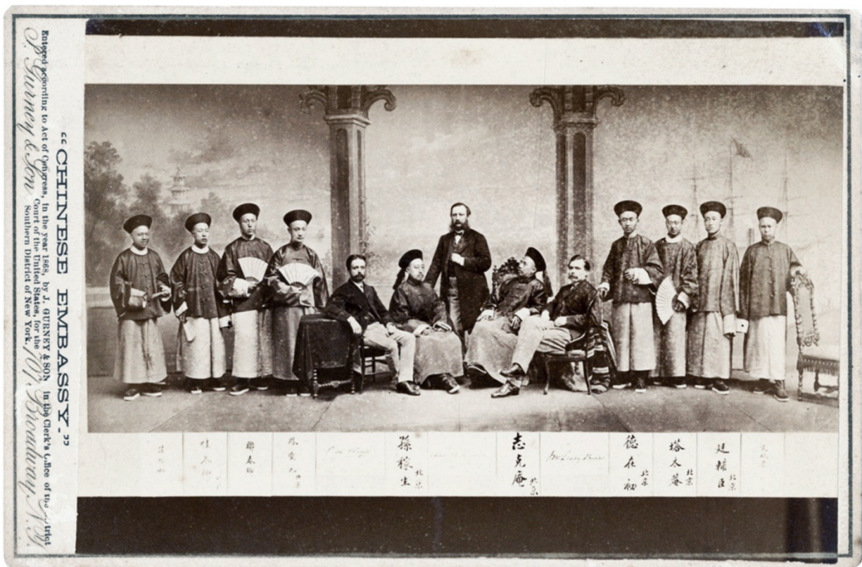
Figure 4: "Chinese Embassy" carte de visite by J. Gurney and Son, 1868. Library of Congress Prints and Photographs Division Washington, D.C. 20540 USA http://hdl.loc.gov/loc.pnp/pp.print . PH - Gurney (J.), no. 4 (B size) [P&P]