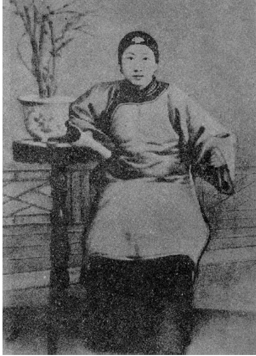
Figure 6. “Photographic Portrait of Qiu Jin” http://www.hangzhoumemory.com/person/910