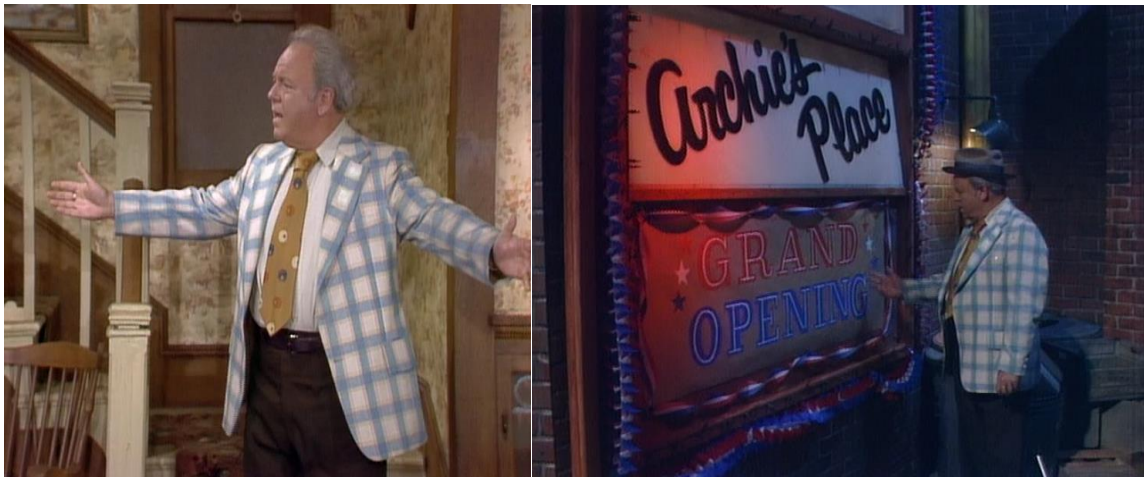
9. "Archie's Grand Opening"

Things had changed for Archie by the time Reagan took his oath of office. He was no longer a "hard hat," but rather a "bona fide businessman" and entrepreneur, taking over Kelsey's Bar in Season Eight and renaming it Archie's Place. 322 Of course, Edith is anxious about Archie's plan to buy the bar, as she fears that the family will lose their safety net, and their home, if Archie quits his job and mortgages the house. But for