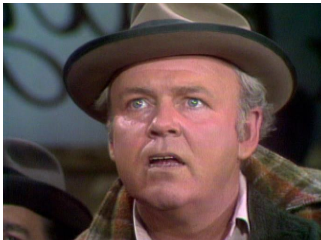
5. "The Man in the Street" (©Tandem Productions, Inc., 1971, 1972)