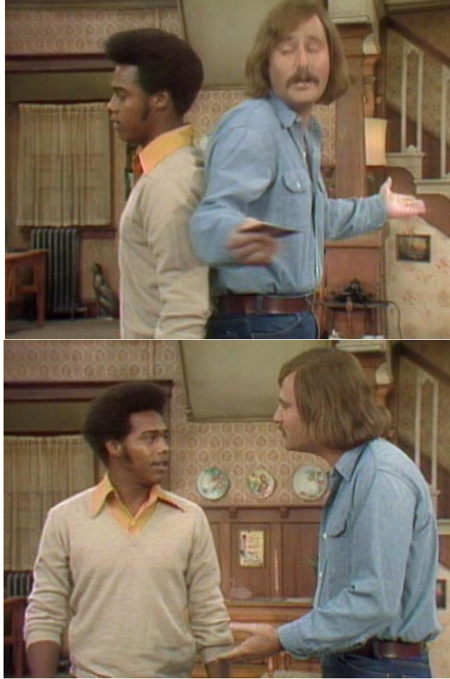
7. "The Games Bunkers Play"

The group believes Lionel, holding up “With It” cards, although Mike refuses to believe that his friend is telling the truth. He becomes increasingly, and hilariously, irritated with each card played. When Mike chooses a card that asks him to tell the players what constitutes his maturity, he answers that he is “open-minded” and “tolerant of the other guy’s opinions.” This response elicits a strong giggle from Gloria, who brings up Mike and Archie’s frequent fighting. Gloria argues that Mike is often as bad as