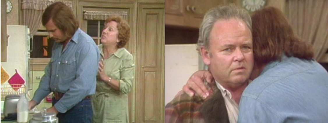
8. "The Games Bunkers Play"

never be.” After urging him to return to the game, Edith leaves Mike alone in the kitchen. hilariously, Archie comes into the kitchen and greets Mike with a curt, “Get away from me, Meathead.” “Arch, I want to tell you something,” Mike says. “Aw, what? ” Archie exasperatedly responds. “I understand,” Mike says solemnly, hugging Archie—who looks utterly perplexed—as the audience roars with laughter.