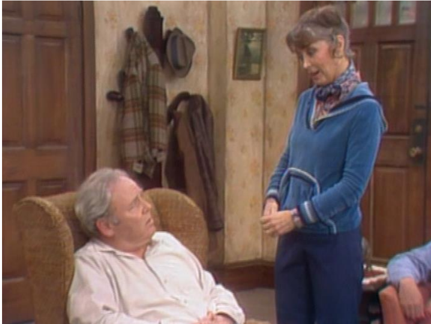
3. "Archie's Helping Hand" (© Tandem Licensing Corp., 1974, 1975, renewed 2002, 2003)

corporate concerns about gender equality. As Archie laments, “Equality is unfair,” adding, “What’s the point of a man working hard all his life, trying to get someplace, if all he’s gonna do is wind up equal?” For Archie, Irene is simply a quota hire. Her presence on the docks—and the institutionalization of equality—signals a loss of his status and privilege.