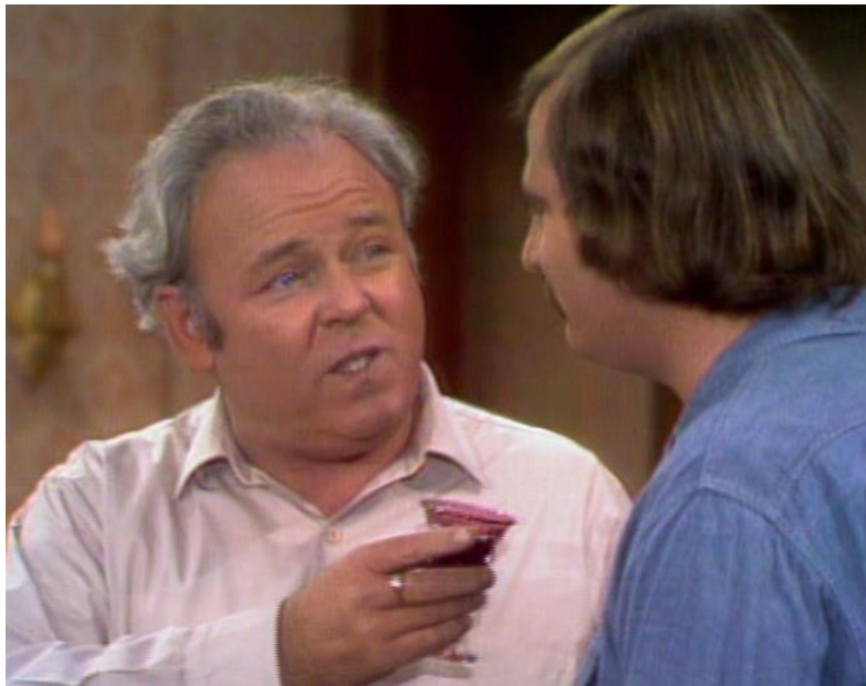
4. "The Man in the Street"

Even though "The Election Story" shows Archie blaming women and minorities, there are moments of openness for Archie, in which his place within a backlash narrative appears questionable. One of these moments occurs in the aptly titled episode, "The Man in the Street." 293 In this episode, Archie and his coworkers are interviewed by a CBS