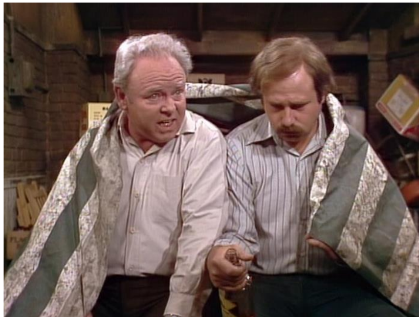
6. "Two's A Crowd" (©Tandem Licensing Corp., 1977, 1978, renewed 2005)

Mike laughs, and asks Archie if all the kids made fun of him. They did, Archie responds, except for one "little black kid by the name of Winston." Stunned, Mike asks, "A black kid liked you?" Winston "beat the hell outta me," Archie answers. When Mike pushes Archie to explain why Winston beat him up, Archie hesitates, and then adds, "Well, he