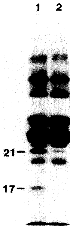
Fig.1. Gel electrophoresis patterns: (1) of the untreated PS II complex; (2) after high-salt treatment. The gel contains 2.5 M urea. Under these conditions the apparent molecular mass of the 23 kDa polypeptide is shifted to 21 kDa as shown on the gel.

EPR spectroscopy was carried out on a Bruker ER-200D spectrometer operated at X-band and interfaced to a Nicolet 1180 computer. Instrument modifications as well as the xenon flash lamp cir-