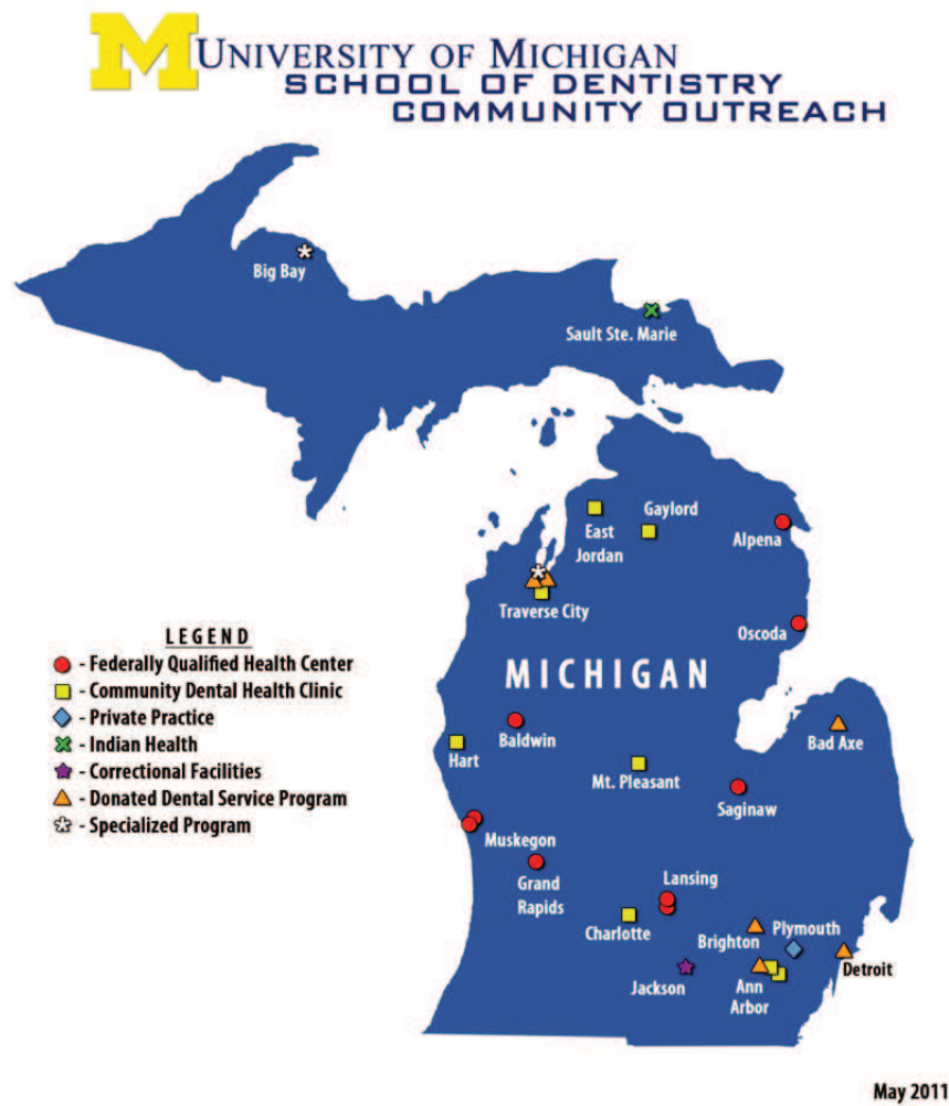
Figure 2. Map of the state of Michigan, showing the diverse types and locations of clinic partners in the UMSOD community-based dental education program

The success of the UMSOD community-based model is evident in the increased access to care in communities with partnering dental clinics, the improvement in students' clinical skills, and the impact on student education through exposure to the needs of underserved communities. Since the beginning of the program's expansion in 2000, the school has developed partnerships with twenty-seven clinics in the state of Michigan (Figure 2). The amount of time students spend in community clinics has increased from three weeks in 2000 to ten weeks in 2010. Since 2004, students have treated 58,652 patients