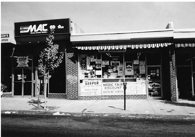
Examples of signs in Chestnut Hill.