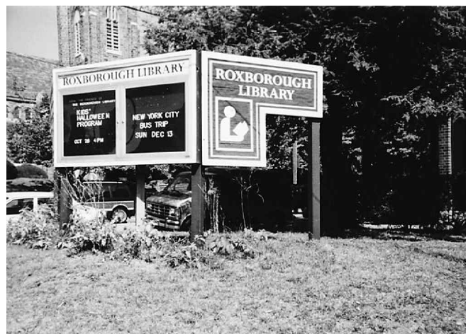
Logographic sign in Roxborough.