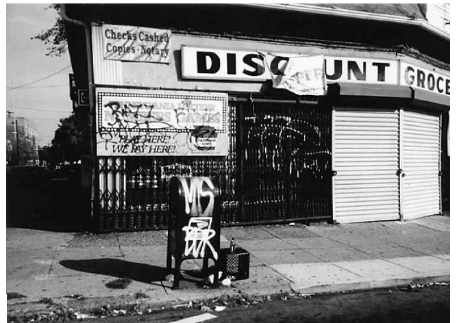
Graffiti covers signs in Kinsessing.