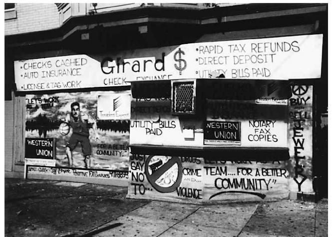
Signs in Kensington.