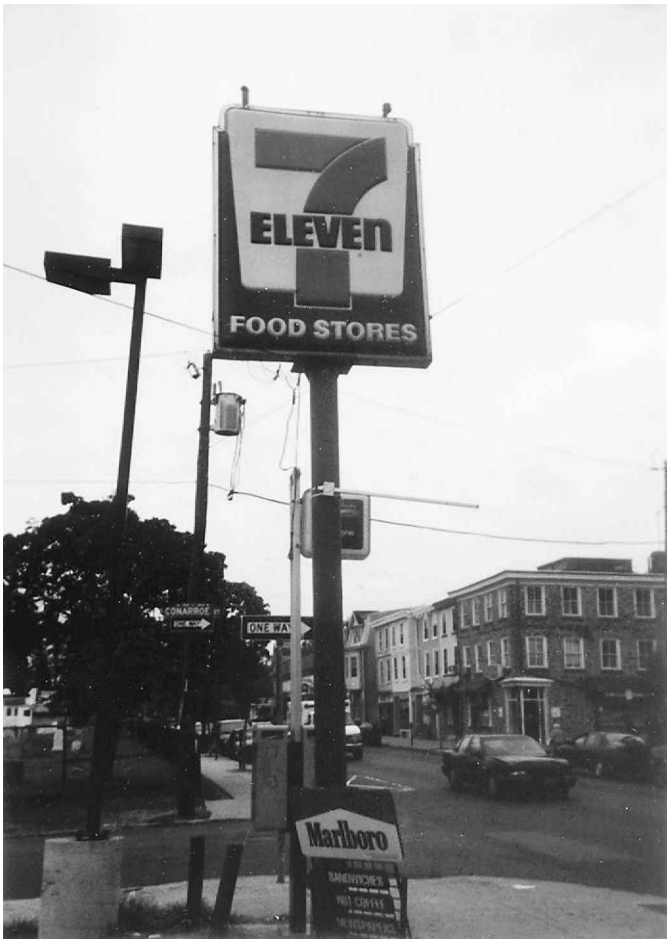
Example of logographic signs in Chestnut Hill.