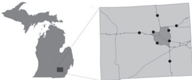
Figure 1. Location of eight sites used to study roadside restoration in Washtenaw County, Michigan, United States. Sites were located on highway interchanges in and around the city of Ann Arbor.

Each plot contained nine subplots, one for each plant species. Each subplot contained 16 individuals of one of the nine plant species. Subplot locations within each plot were randomized. Each plot measured 6.5 \times 6.5 m, and each subplot was 1.5 \times 1.5 m, with 1 m between each of the subplots. Before planting, a brush cutter was used to trim all vegetation to about 30 cm height throughout the study area, including a 1-m buffer in all directions from the plots. Additionally, at each subplot, we removed all aboveground plant material with a brush cutter. We installed the 16 seedlings of each species in each subplot in a 4 \times 4 grid, with 30 cm between each seedling. Seedlings were planted directly into mown turf and surrounding vegetation was allowed to regrow