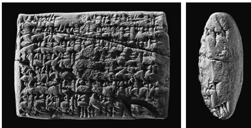
Fig. 2. NBCT 848, obverse & right edge.