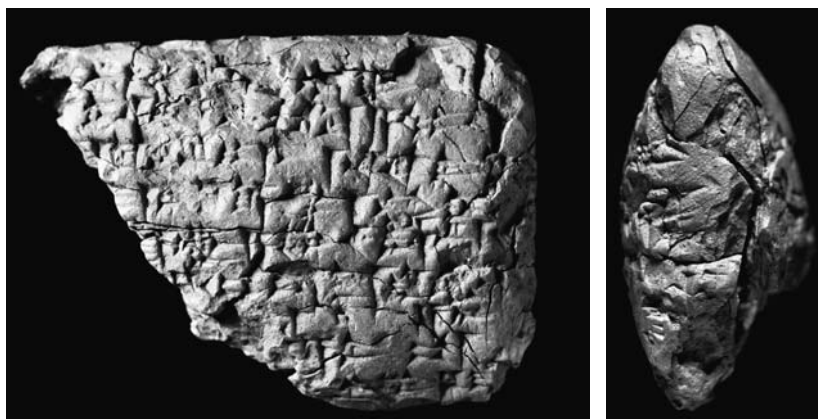
Fig. 3. K. 4709 (IV R 35 no. 8), © Trustees of the British Museum.