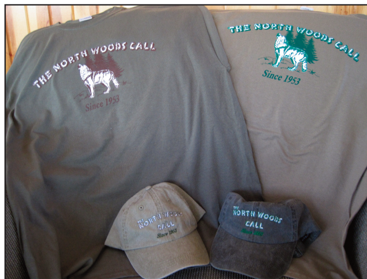
T-shirts (military green & prairie dust) and caps (khaki & hunter green)

Stuff those stockings with North Woods Call apparel