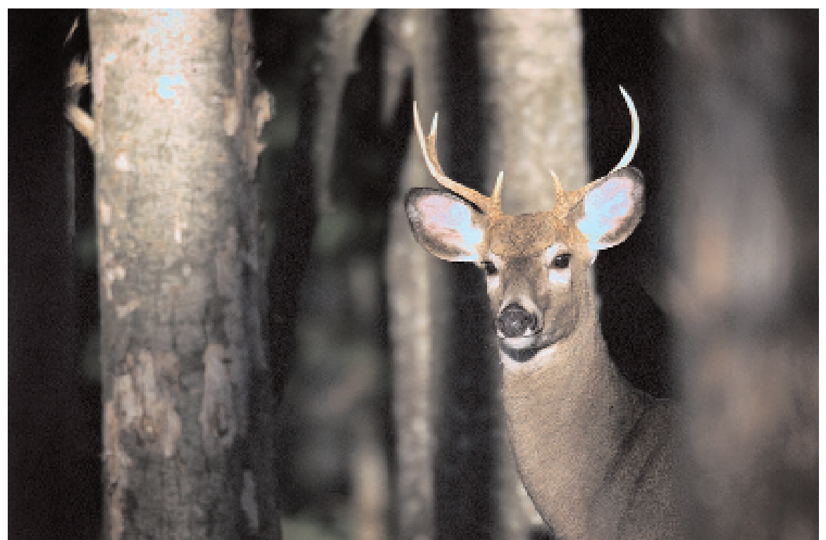
White-tailed deer in northern Michigan