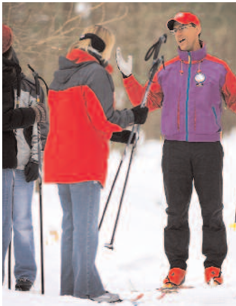
Social networking can be done as successfully on a winter trail as it can on a home computer or smart phone. (DNR photo)

—Michigan Department of Natural Resources