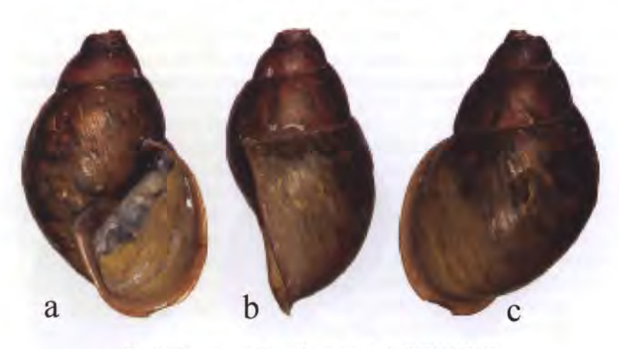
Fig. 2. Three views of Partula meyeri, n. sp., BPBM 255947.

The tip of the shell spire is broken, but other than a small hole and crack on the dorsal body whorl and a small chip off the anterior peristome, the shell is rather well preserved. Extrapolating for the broken tip of the spire, the shell measures approximately 16.5 mm in length and 10.5 mm in width.