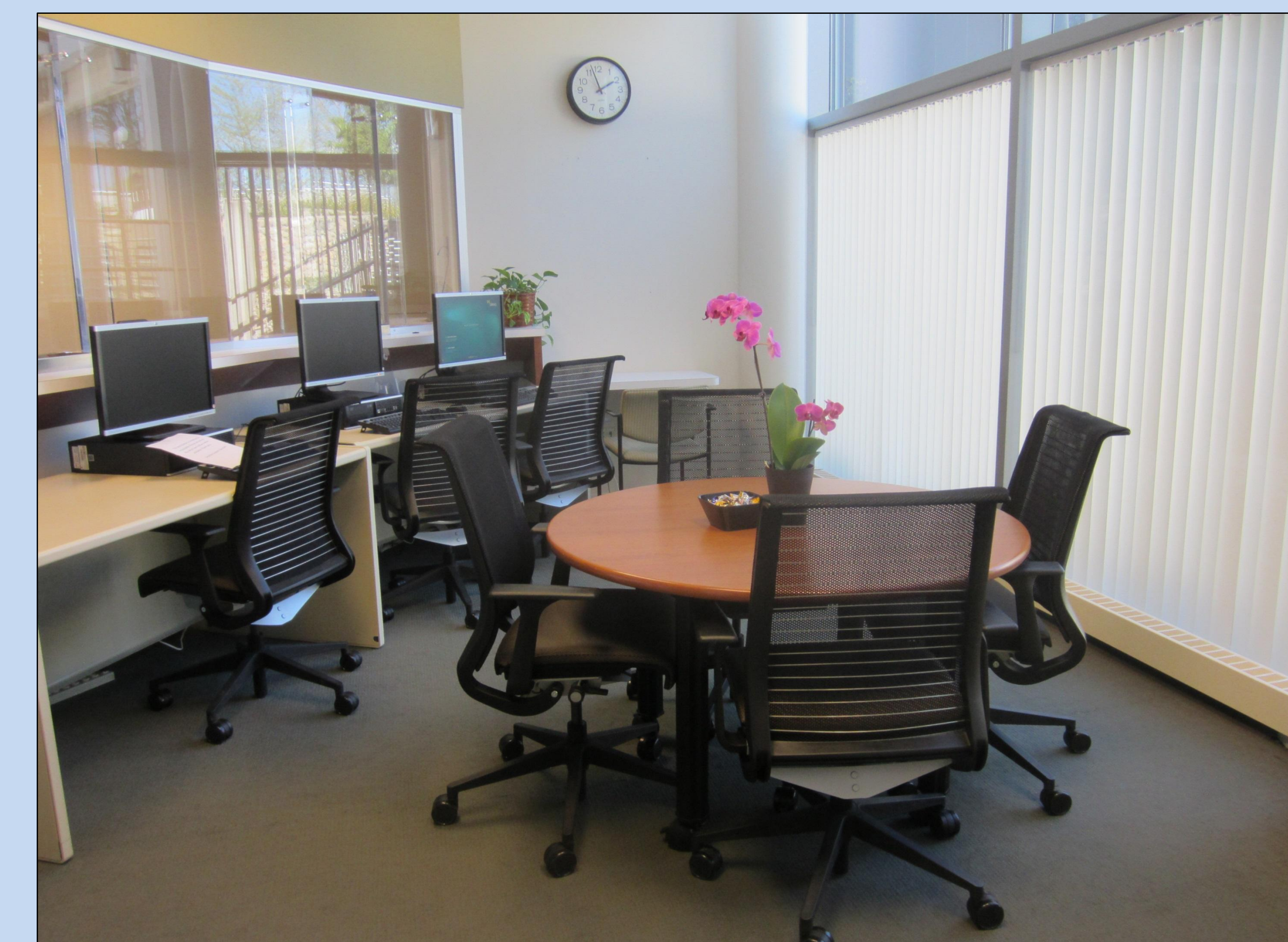
MLibrary@NCRC is designed to reflect a focus on resources, services and collaboration and to market the librarians' role in partnering with users.