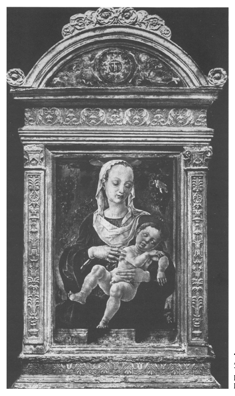
40 Cosmè Tura, Madonna and Child , Venice: Accademia.

the dominant agenda of the work. Although it has been seen as a nostalgic account of exemplary learned conversations during the 'Golden Age' of Leonello d'Este, Decembrio's text reads as a mythologizing of the previous reign in order to criticize the cultural milieu under Borso d'Este, to whom the work was dedicated in 1465.<sup>52</sup> The conversations in De politia litteraria implicitly strike at several features of court culture under Leonello's successor: the reduction of nobility to a