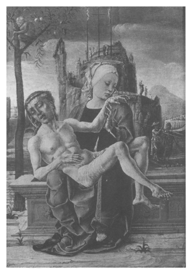
38 Cosmè Tura, Pietà , Venice: Museo Correr.

calligraphic ornaments, demonstrations of masterly penmanship, are picked up explicitly in the broken, intricate folds of the Madonna's mantle.