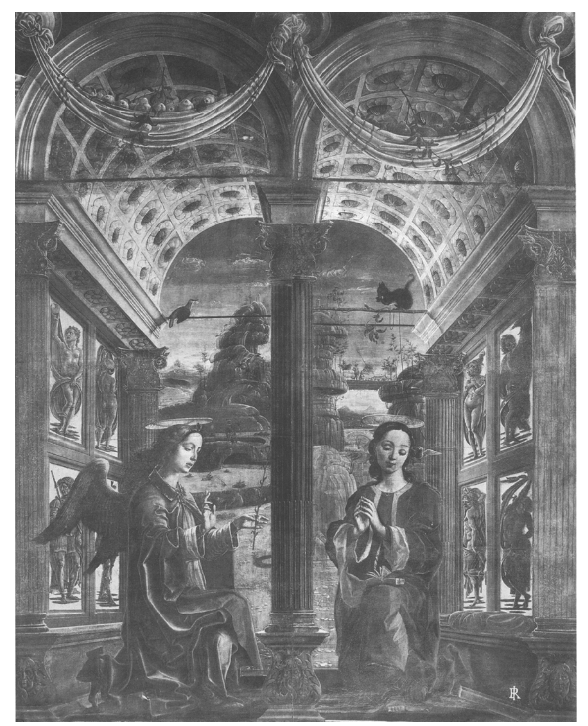
34 Cosmè Tura, Annunciation, inner face of organ shutters, Ferrara: Museo del Duomo.