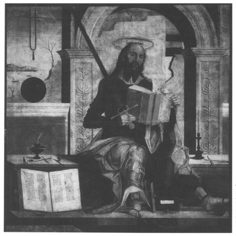
43 Antonio da Crevalcore, St Paul, Rome: Fondazione Memmo.

within the Latin words 'Felix Augusta', and this places his identifiability as much in the form of the words and in the quality of their execution as in their sense. The fabulous red banner in Tura's Execution of Saint Maurelius , a labyrinthine fantasy claiming much of the visual interest in this little scene showing the martyrdom of Ferrara's patron saint, might be identified as a similar kind of virtuoso demonstration (plate 36). The unusual tondo form of this and other narrative scenes by Tura may itself reflect the modes of pictorial framing characteristic of book production.