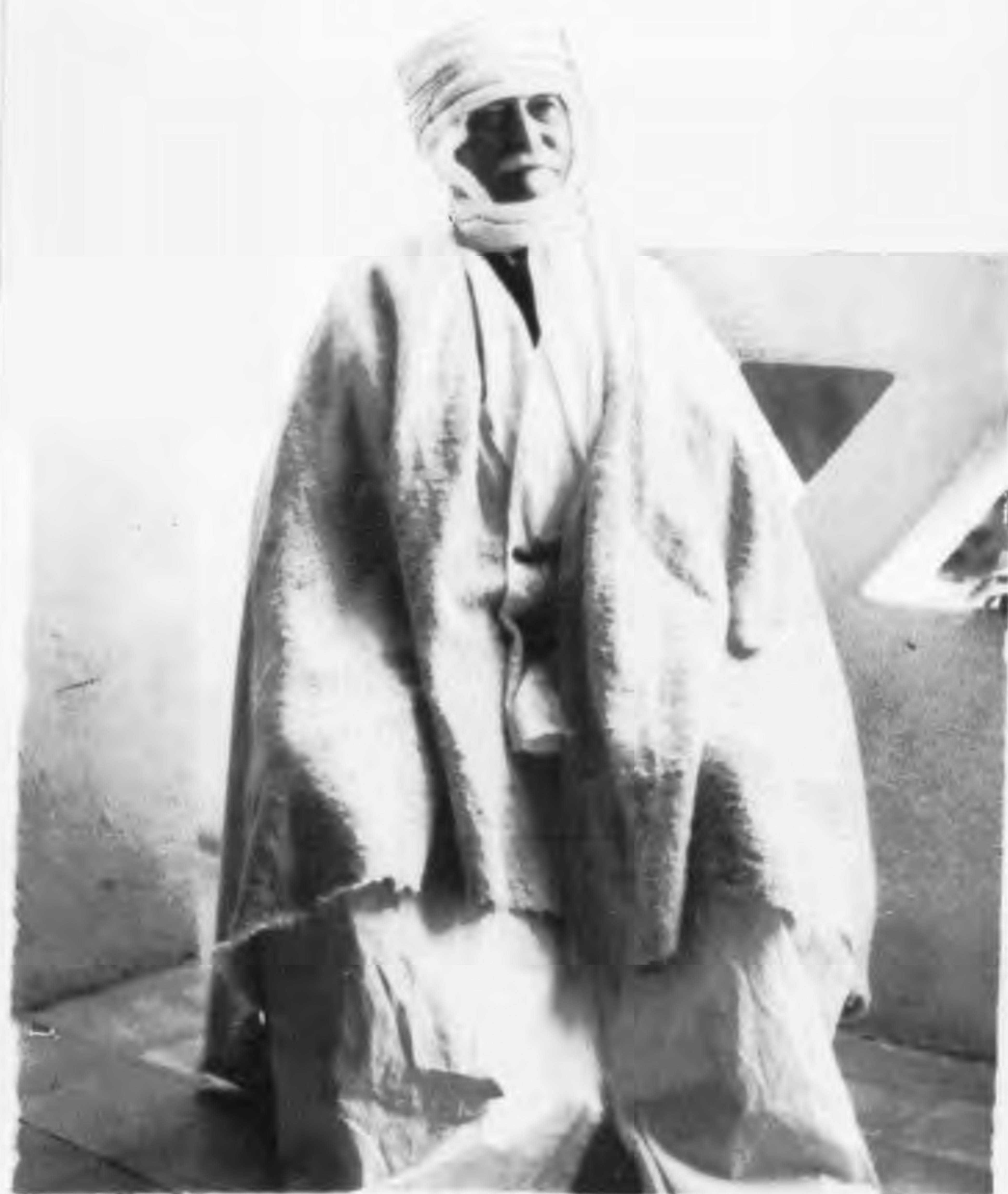
The writer in Arab dress