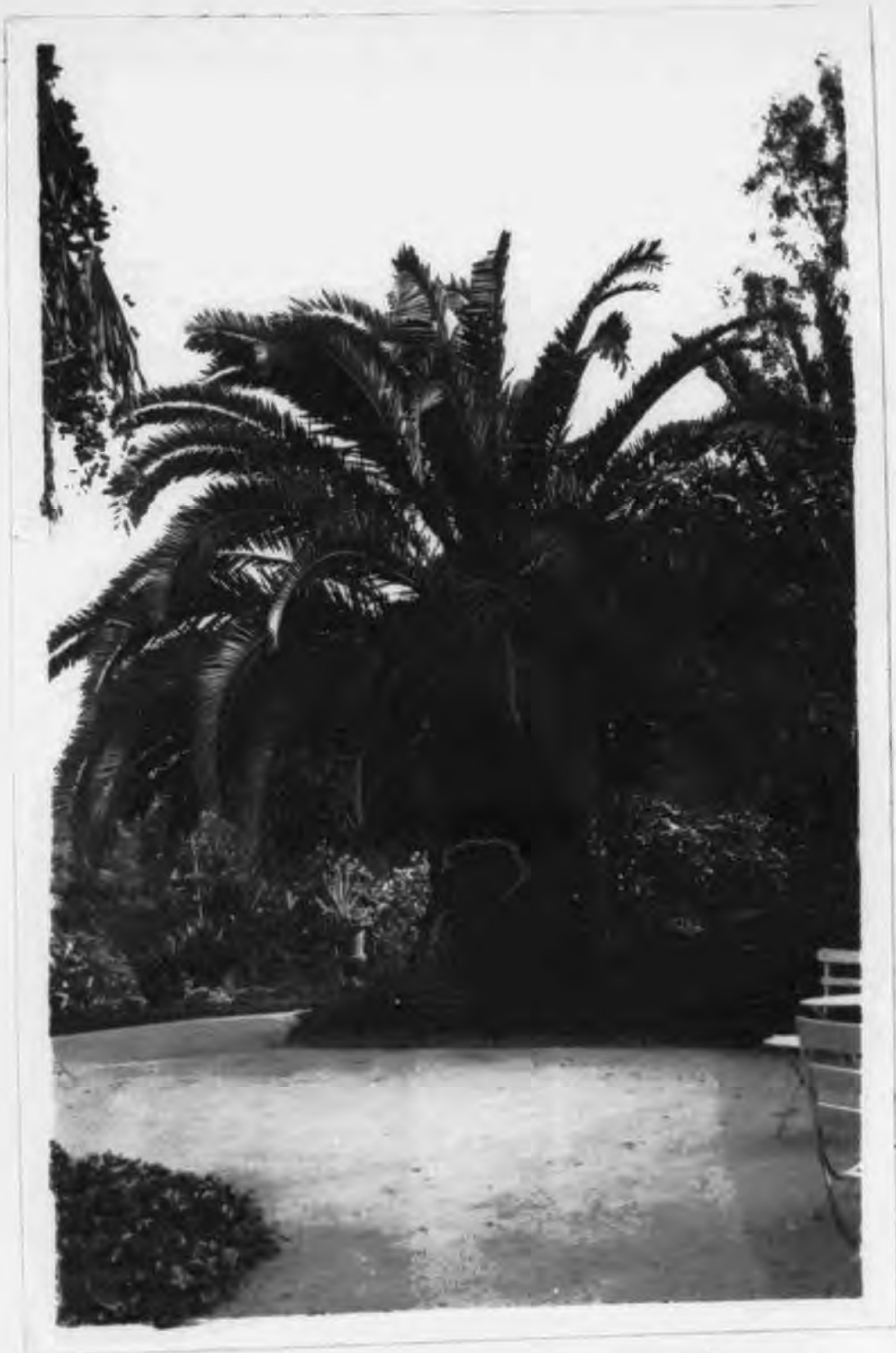
Garden of Allah.