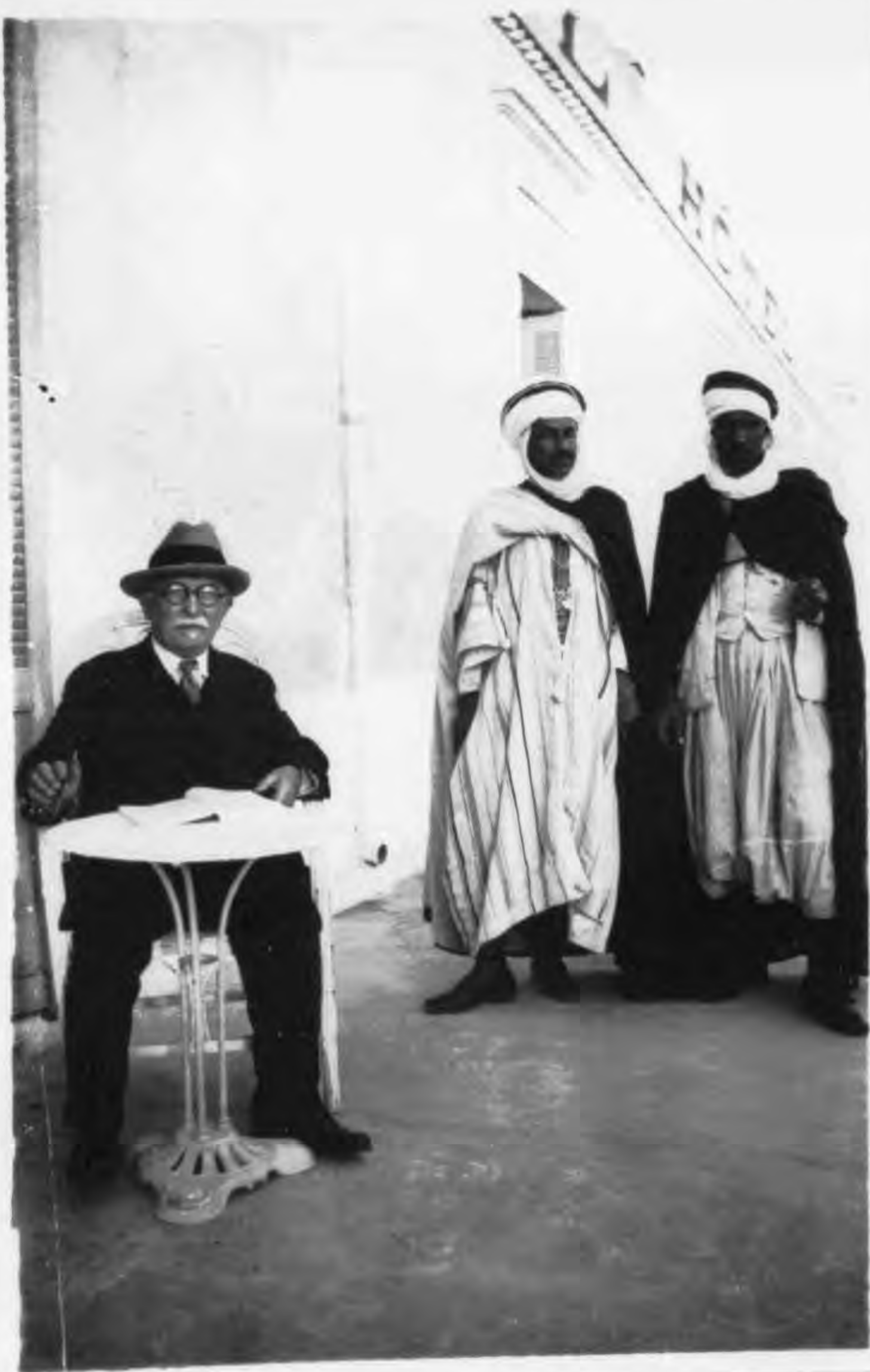
My two guides. Balcony of Hotel Royal, Biskra.