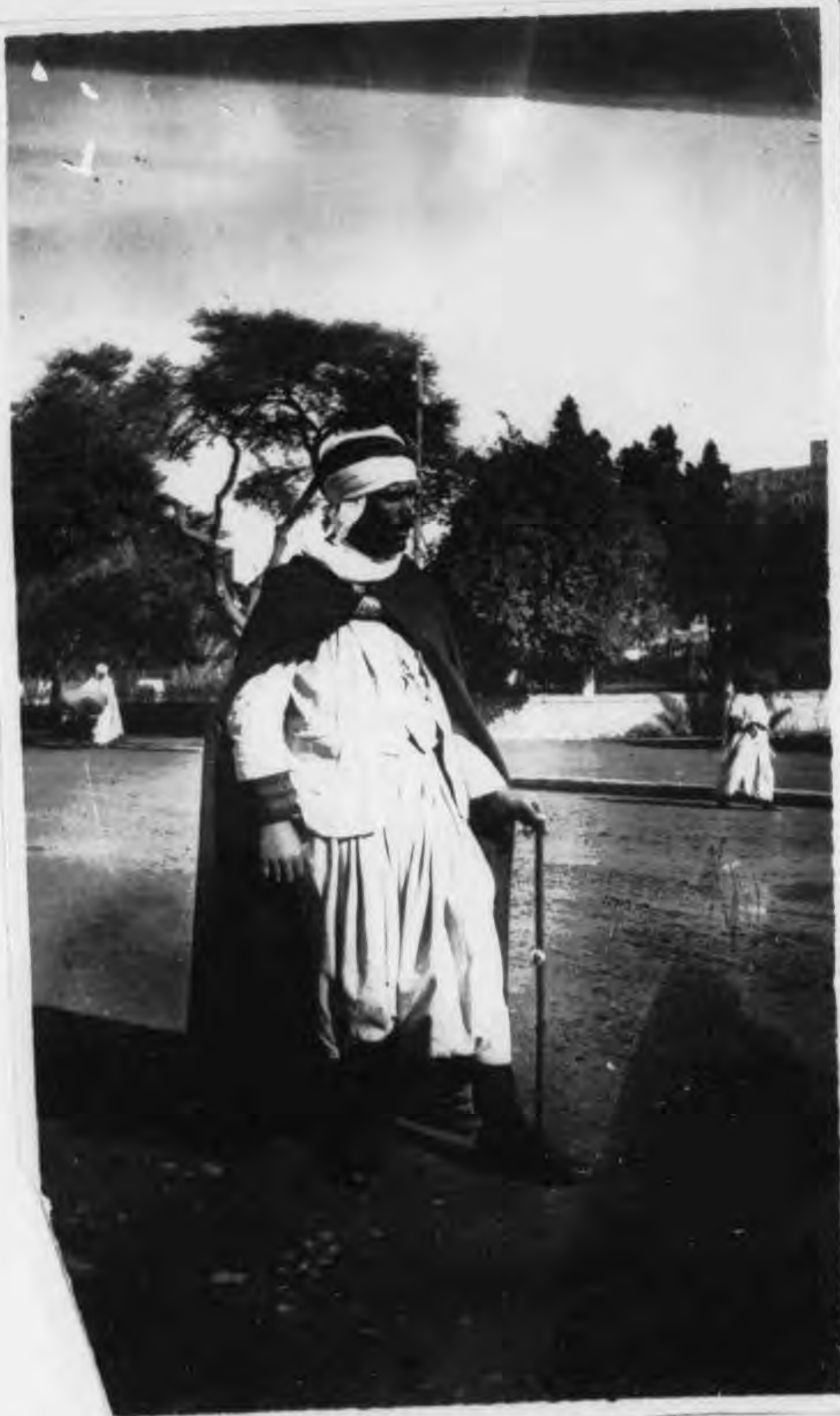
One of my guides.