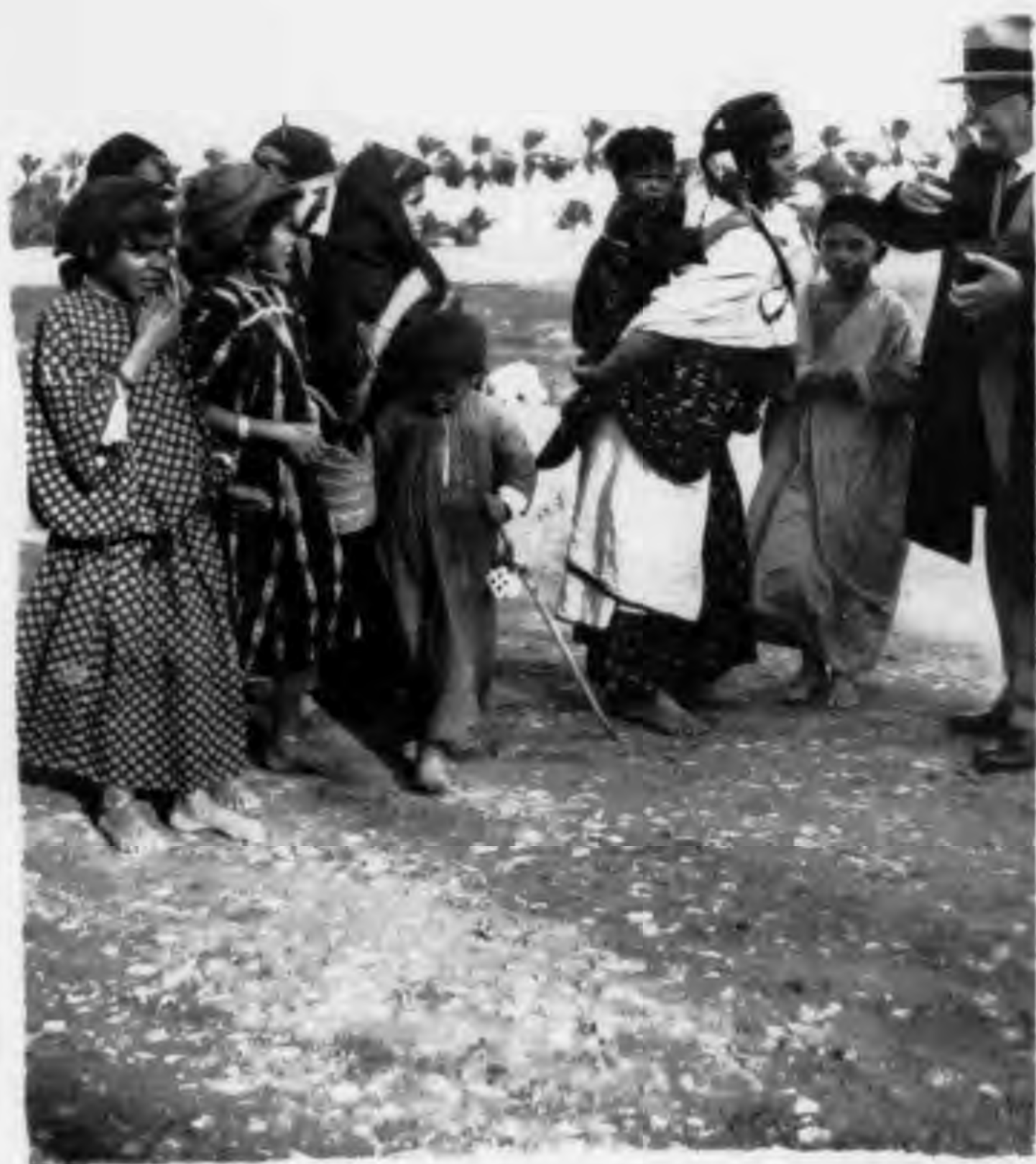
A good posture exercise.