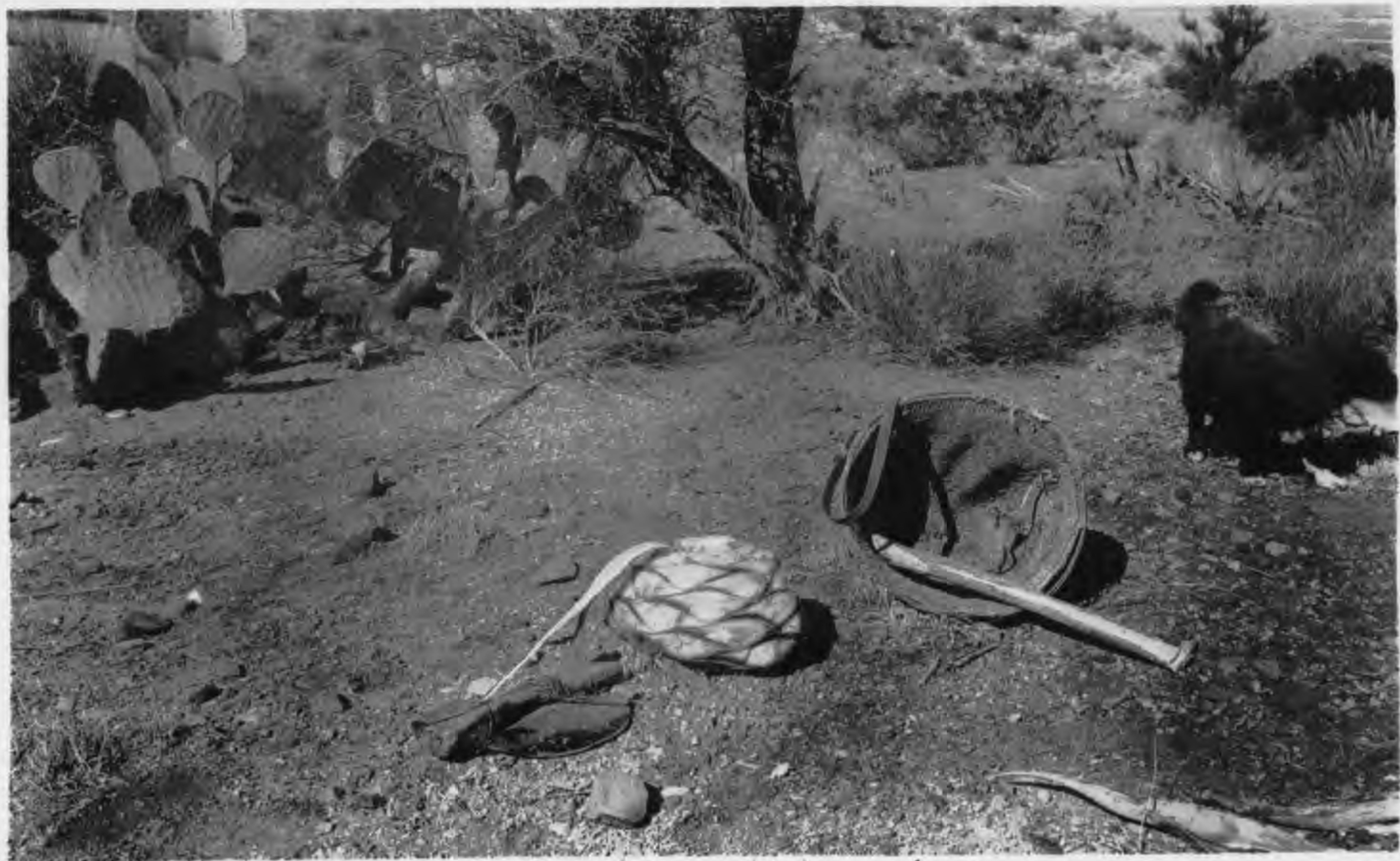
agave stump after trimming.