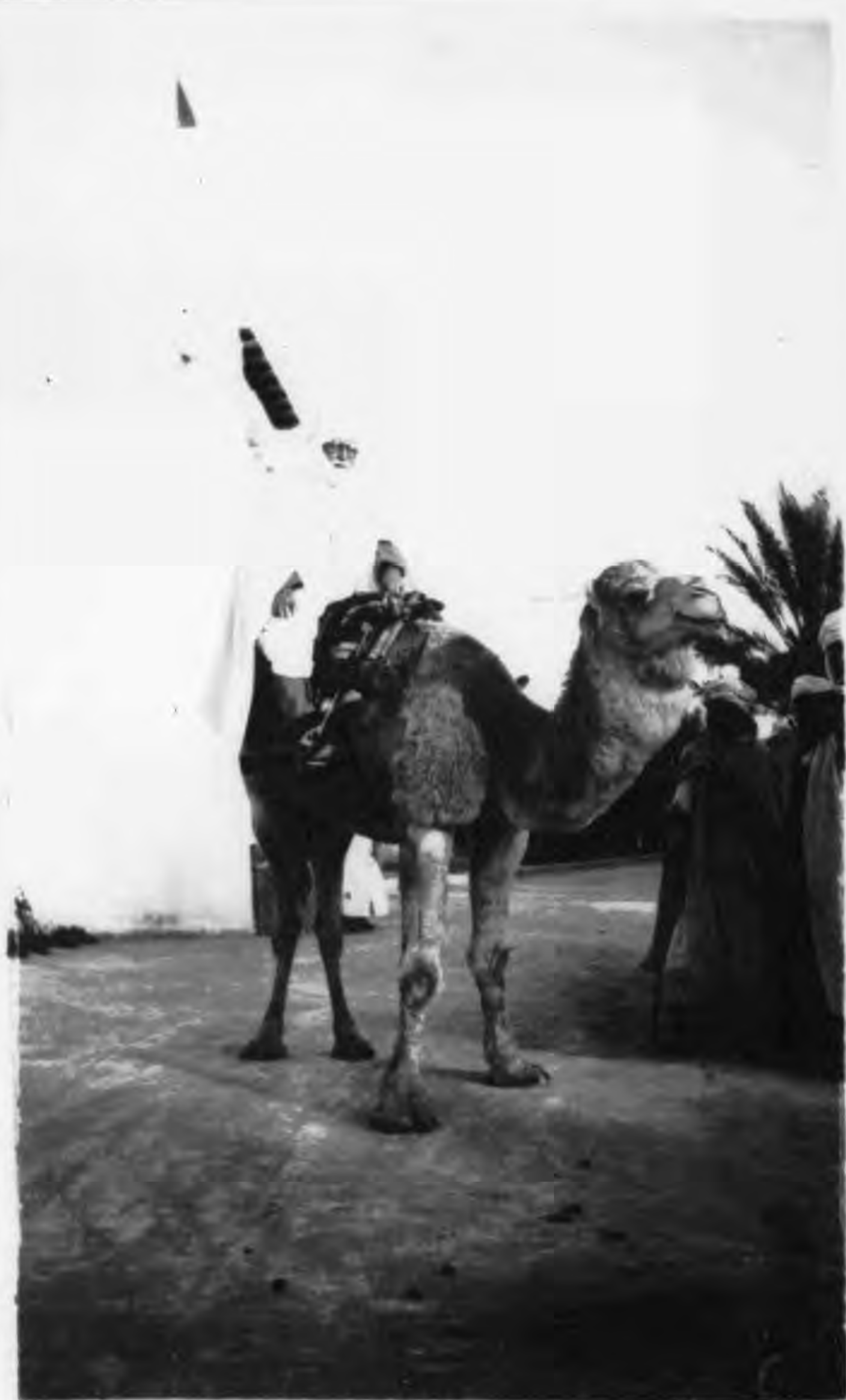
Starting off for a camel ride in the desert.