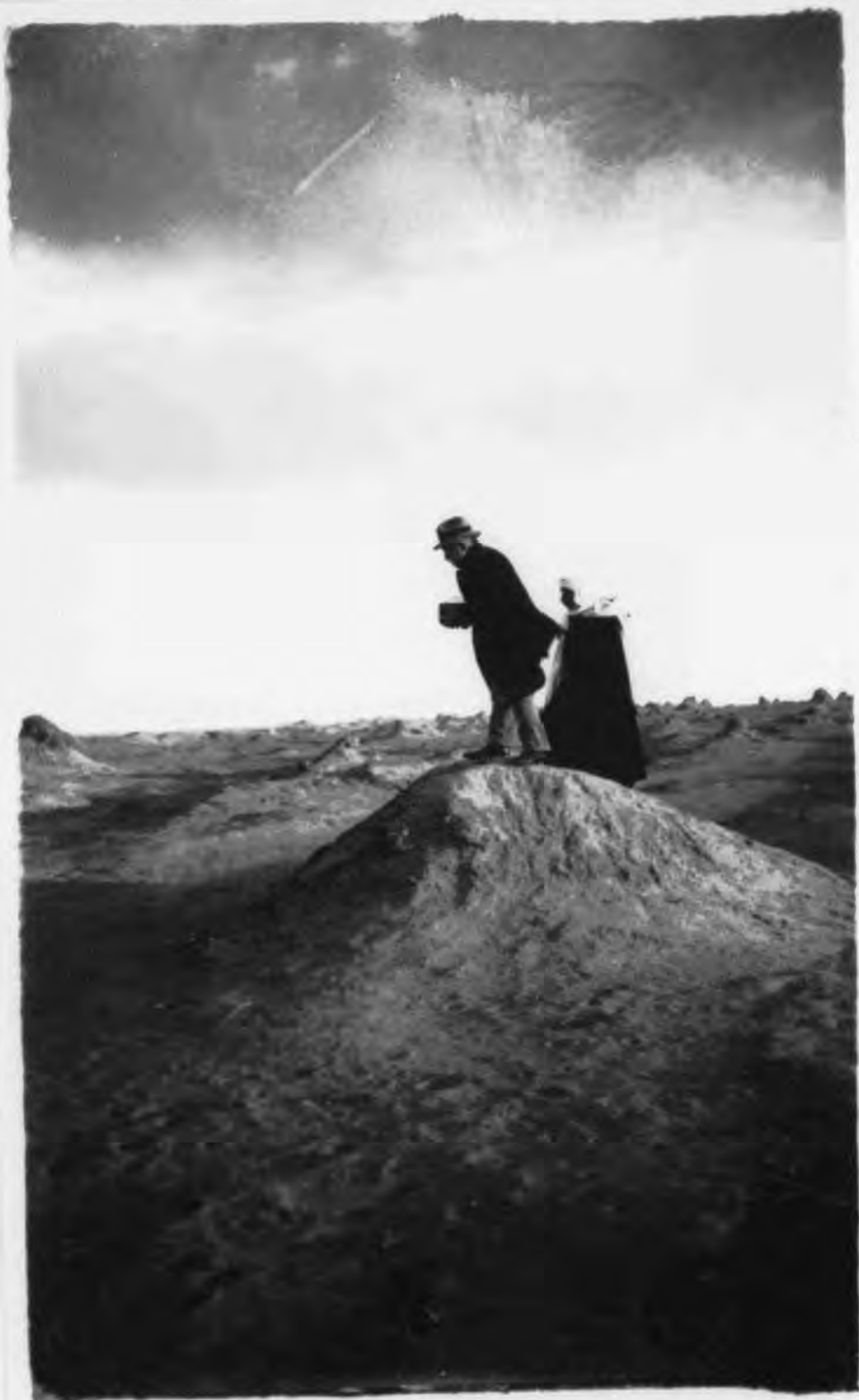
Taking movie of a young camel. Sand dunes near Biskra.