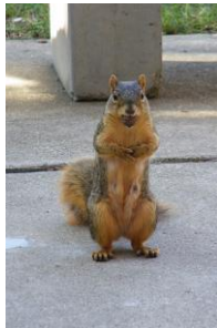
Doing Well for Those Doing Good Michigan Library Association Academic Libraries 2014