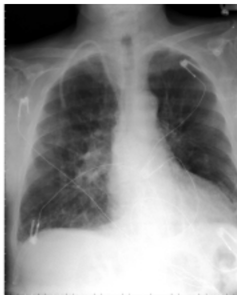
FIG. 2 Initial emergency department chest x-ray performed on this patient, who presented with signs and symptoms characteristic of a wet and warm profile. Cardiomegaly, Kerley B lines, and pulmonary congestion consistent with congestive heart failure were noted.

gen = 57 mg/dl, creatinine = 7.8 mg/dl, glucose = 340 mg/dl, troponin = 0.09 ng/ml.