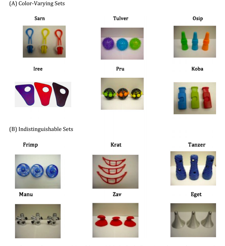
Fig. 1. Item sets in Experiments 1 and 2, with novel labels, including (A) color-varying sets and (B) indistinguishable sets.