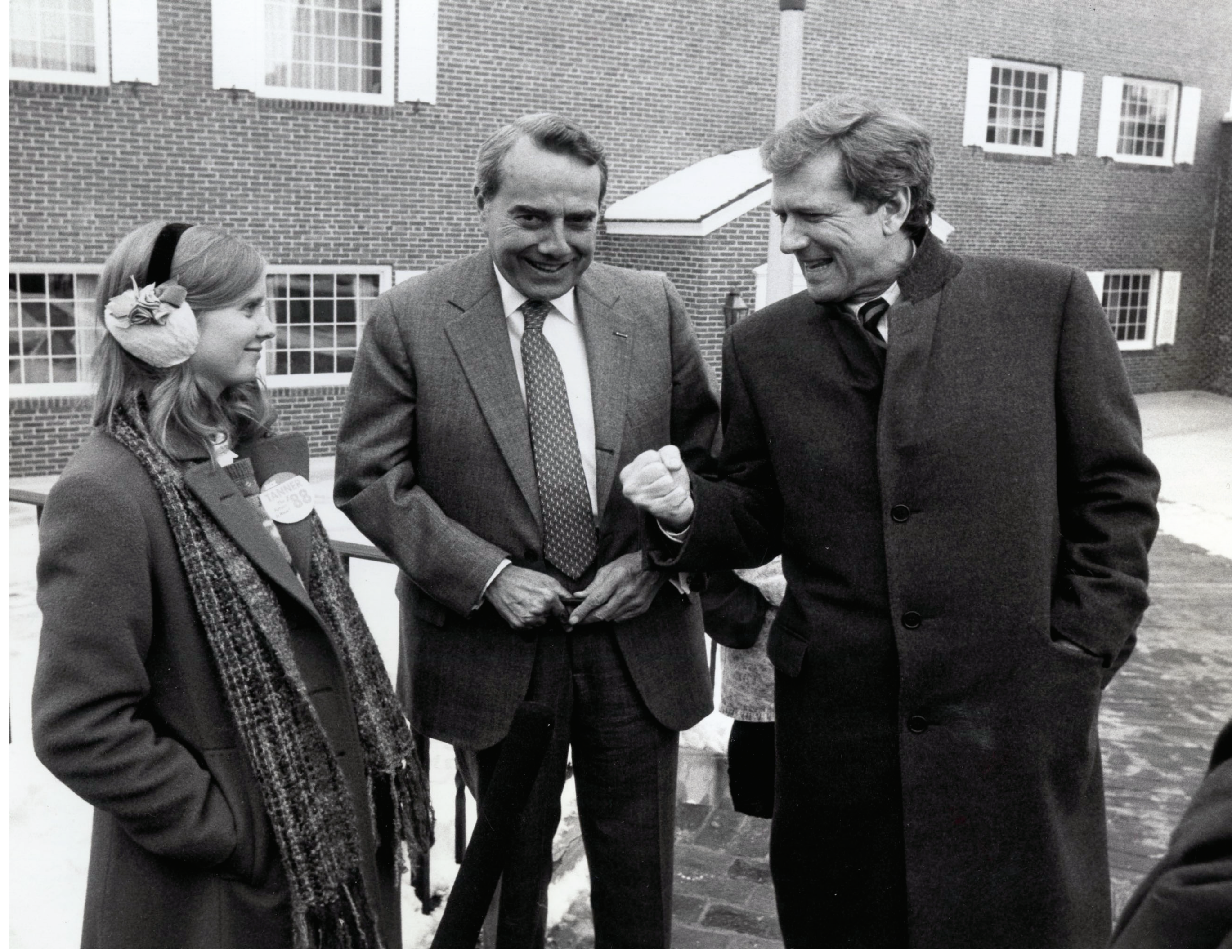
Photograph during the New Hampshire primaries, 1988. Fictional candidate for the Democratic nomination Jack Tanner (right, Michael Murphy) and daughter Alex (Cynthia Nixon) meet a real Republican candidate, Senator Robert Dole, in New Hampshire in Tanner '88 : Episode "Dark Horse."

Coincidentally, there was a John Tanner also campaigning while Tanner '88 was being broadcast. John Tanner (not to be confused with Jack Tanner, the character of the series) was successfully elected to Congress from Tennessee, and here humorously shares his condolences on Jack Tanner's loss and invites Altman, actor Michael Murphy, and writer/producer Garry Trudeau to attend the celebration when he is sworn into office.