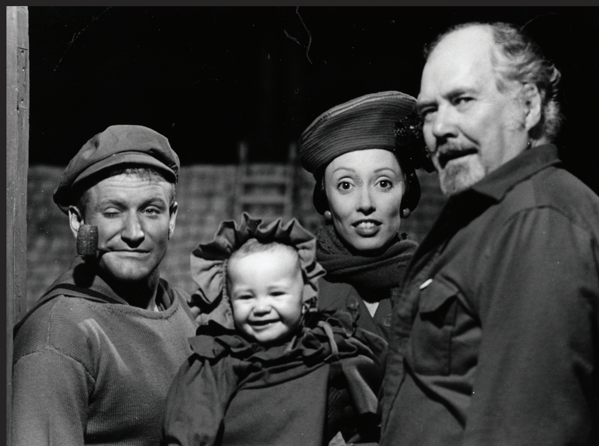
Photographs on the set of Popeye (1980).