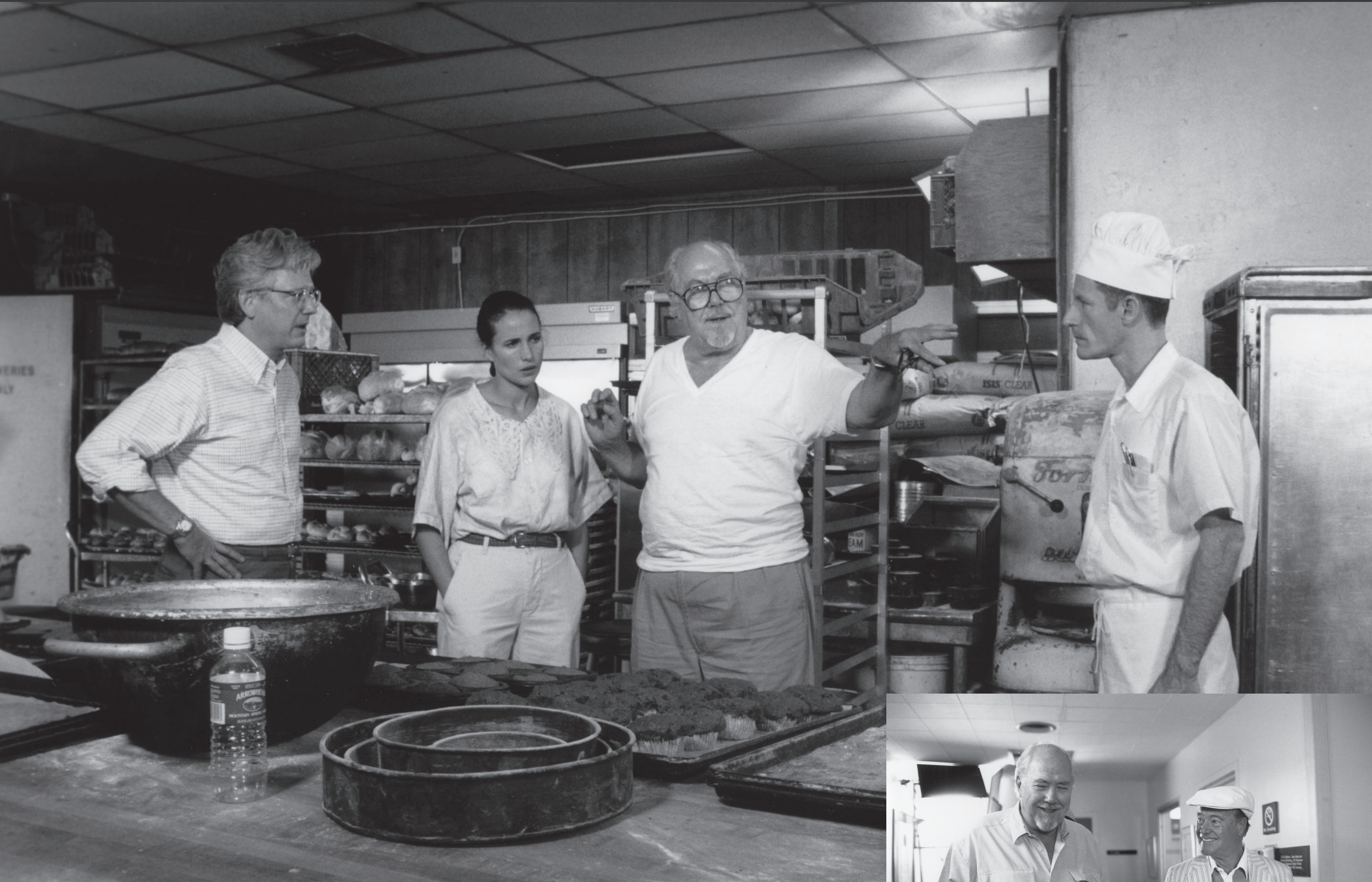
Two photographs on the set of Short Cuts (1993). Robert Altman with Jack Lemmon (right) and with Bruce Davison, Andie MacDowell, and Lyle Lovett (above) on the set of Short Cuts , a film based on the short stories of Raymond Carver chronicling the fleeting encounters and chance meetings of various Los Angeles residents.