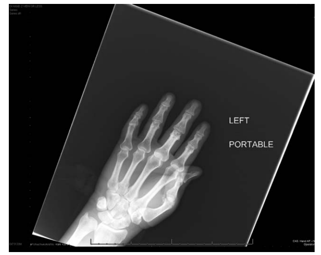
FIG. 2. Plain radiograph of the left hand that demonstrated mild soft tissue swelling over the dorsum of the hand.

Given this patient's fulminant presentation, he was appropriately started on a very broad anti-infective regimen. Although fungal infections are less likely, his current